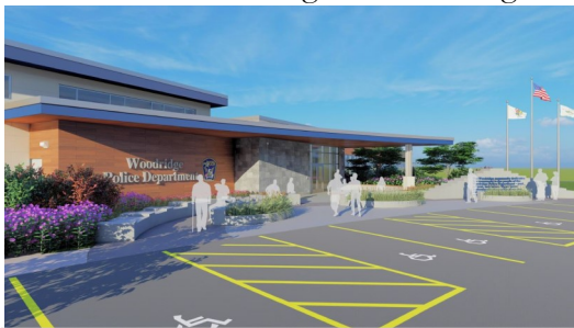
Rendering: Future Woodridge Department

Also, please see the Woodridge Police Department homepage for more information