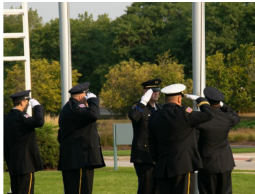
Honor Guards saluting the American flag