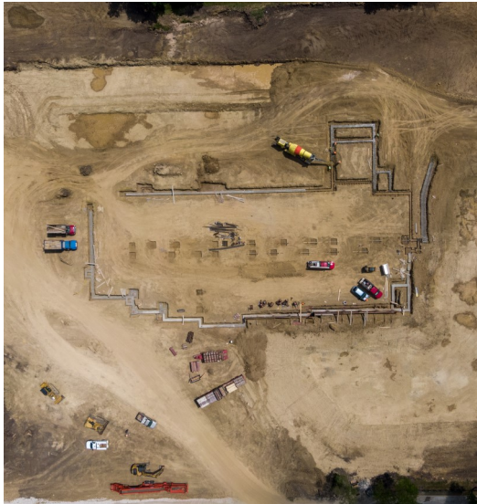
This drone image shows the concrete footprint of the future Woodridge Police Department facility.

Crews also poured concrete for the new facility, graded the south access road, graded and installed the north haul road, and created a grading basin.