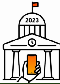
Photo station in front of Village Hall from 10 am - 1 pm