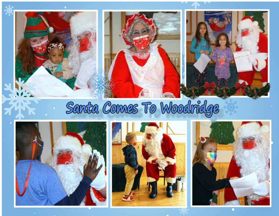
Santa Comes To Woodridge

Santa and Mrs. Claus visited Woodridge on Saturday, December 4. The event, hosted by the Woodridge Special Events Committee, is a Woodridge tradition. Additional event photos are available courtesy of the Woodridge Special Events Committee.