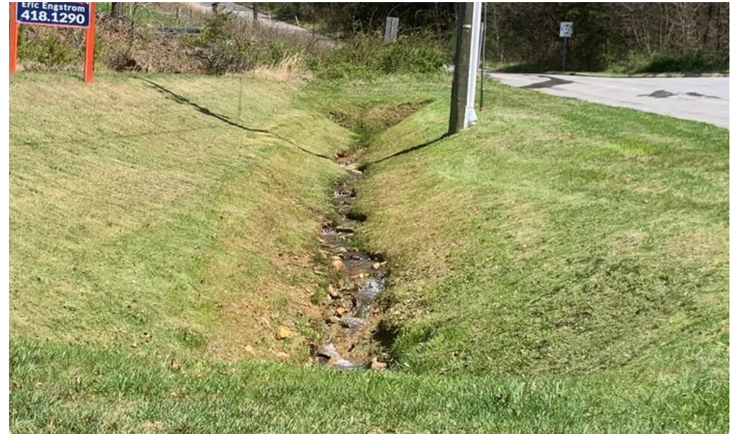
Reynolds Mountain Blvd ditch improvement ($3,500)