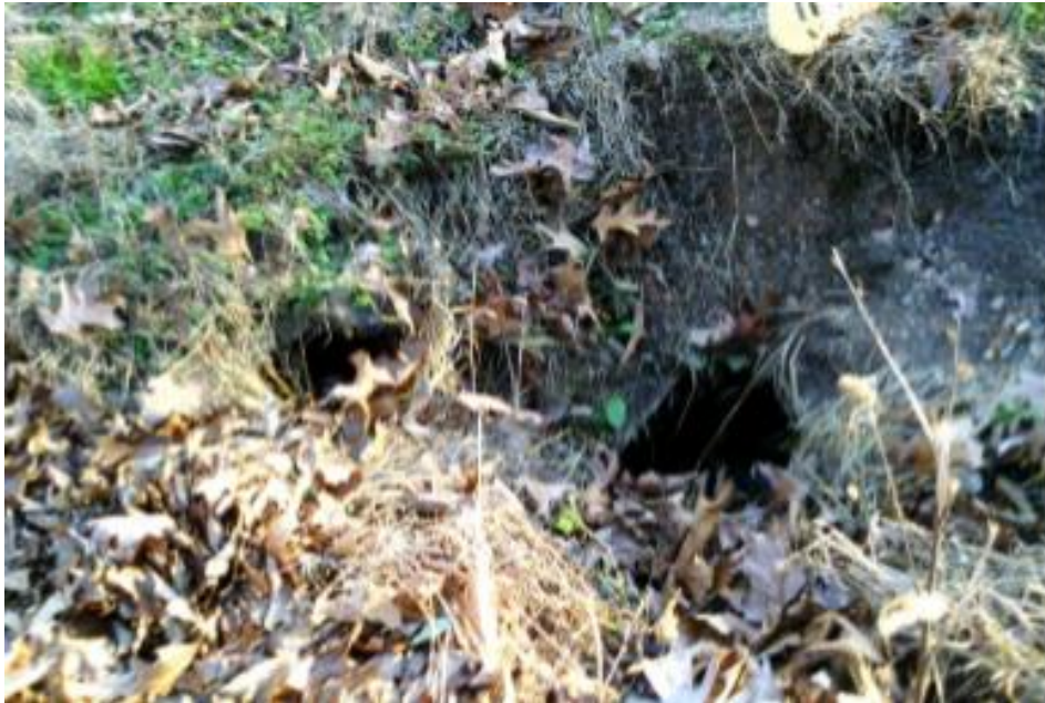
Hillcrest Rd open drains