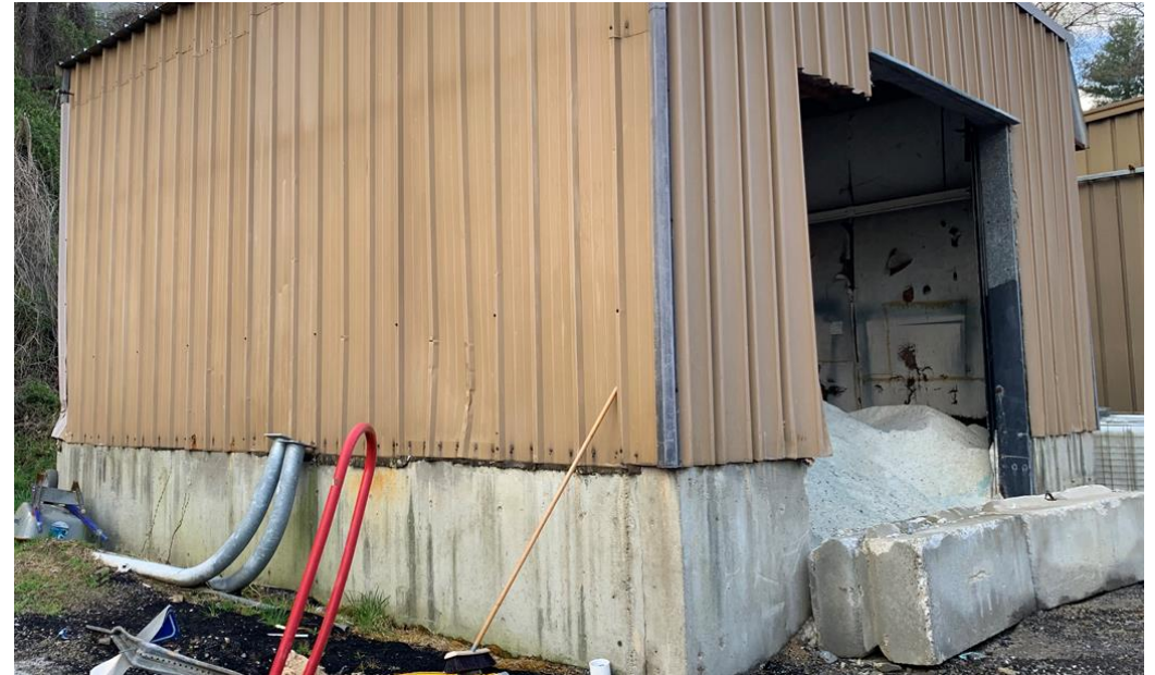
5 Taylor St (Public Works) salt storage bin