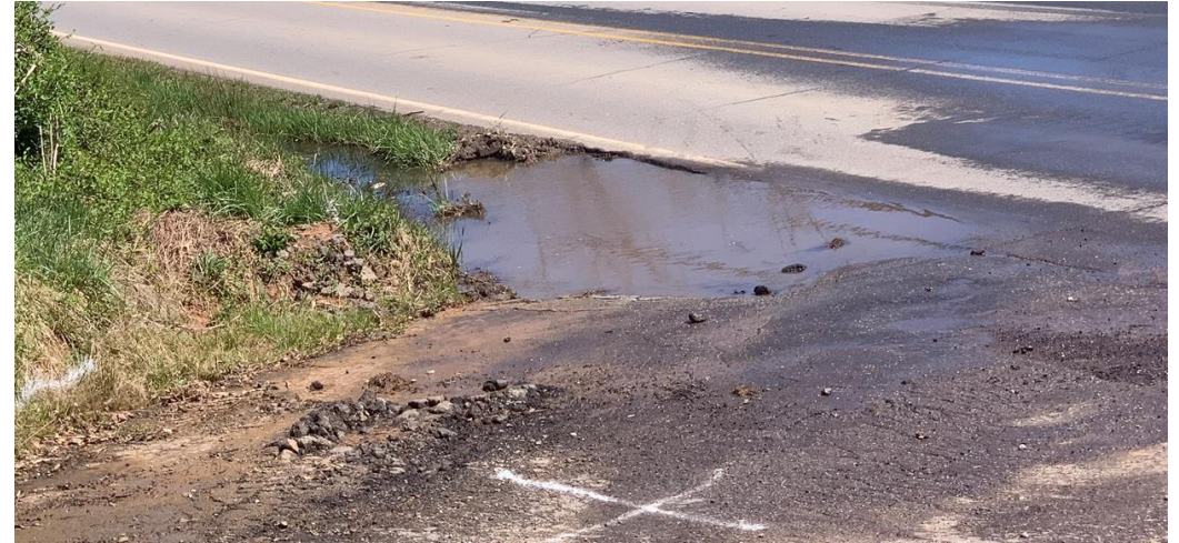
Norton Drive collapsed culvert ($4,620)