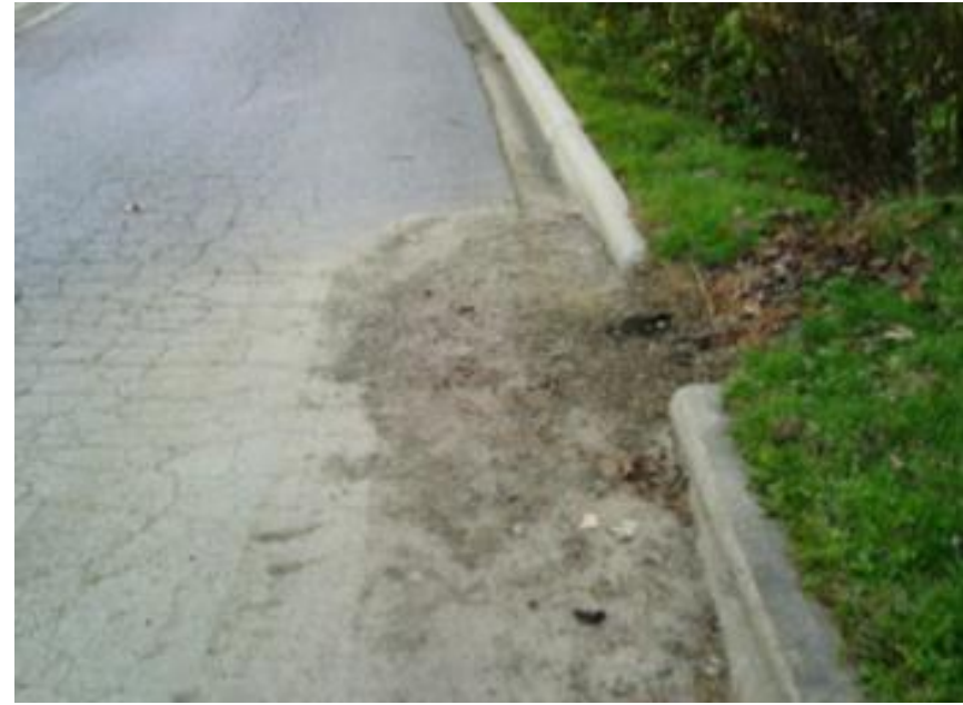
Keeping Kyle Crossing debris at storm drain