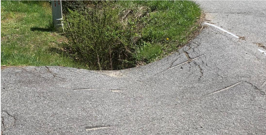
Wellington Rd collapsed/deteriorating culvert ($4,650)