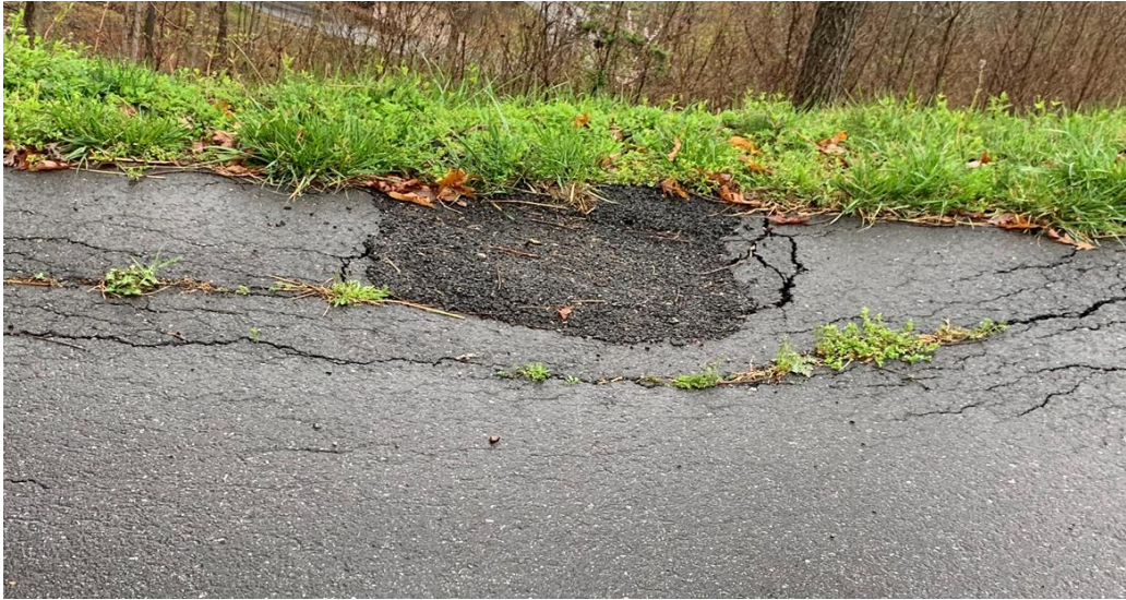
Denali Drive sink hole ($5,985)