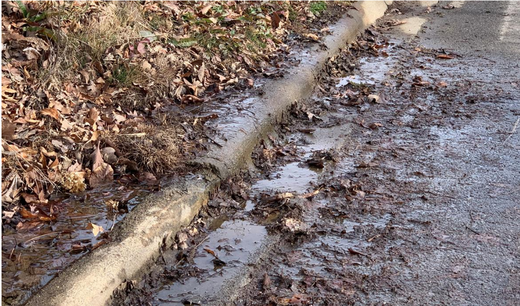
Lake Town Rd runoff