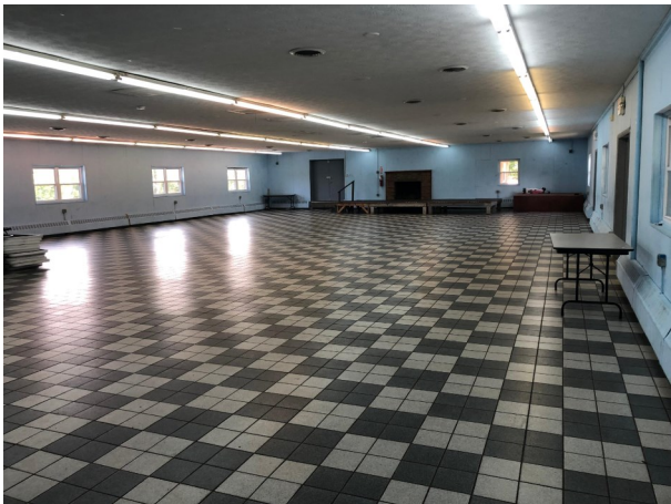
The community center rents for $265/day + deposit.

Located at 23 Community Street, the Community Center contains a full kitchen, a small stage, seating and tables for more than 200 guests as well as restroom facilities. The Woodfin Community Center is available for rent by the day. In order to inspect or make arrangements to rent the facility please call Town Hall. Alcohol is not permitted at the community center.