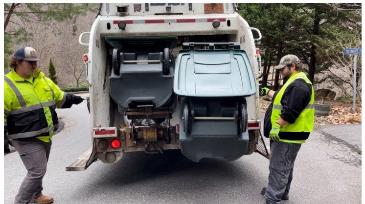
Woodfin sanitation staff operating the new trucks w/ lift gates.