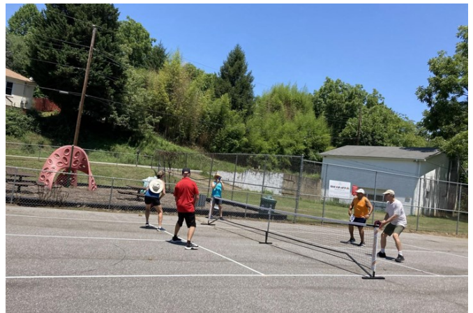
Volunteers help create a temporary pickleball court used to gauge community interest in permanent facilities.

Volunteers serve an important role throughout the town, including town government. The town's boards and committees are made up of volunteers who bring their knowledge and experience to important functions and decisions. Other individuals contribute in numerous other ways. If you have an interest in contributing to the town please share your thoughts by emailing the town manager at: stuch@woodfin-nc.gov .