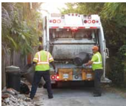
Manual collection increases the risk of a variety of safety incidents.

S olid waste collection workers are potentially exposed to health, environmental, and safety risks due to the weight of the waste to be collected and various chemical and biological materials sometimes present in the waste stream. Typical rear-loader operations require manually lifting materials into the collection vehicles. Statistics from such programs suggest that collection crews lift on average, over six tons (13,000 lbs.) per worker per day. In general, this heavy, repetitive, manual lifting combined with an aging workforce tends to