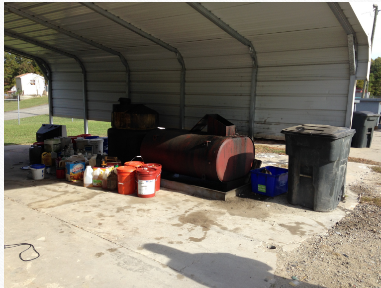
Jones Creek Convenience Center Site