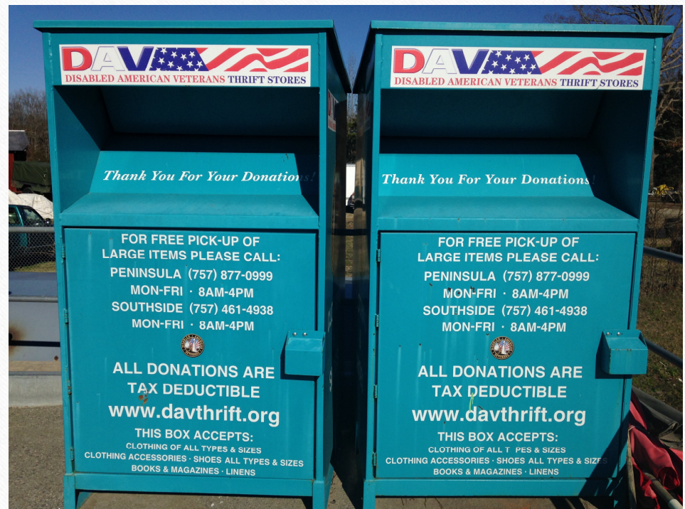
DAV collection boxes located at Jones Creek.

Currently, through a Pilot program with the Disabled American Veterans (DAV), two Convenience Center sites (Jones Creek & Staves Mill) have been equipped with clothing, shoes, and textile collection boxes that are serviced by the DAV.