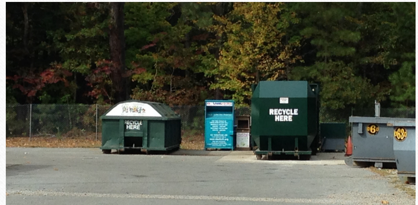
Staves Mill Convenience Center Site