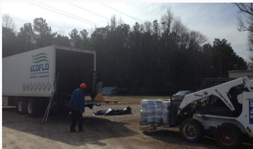
County HHW collection in progress.

Founded in 1982, ECOFLO was one of the first TSDFs designated under RCRA law. ECOFLO provides the County with turnkey hazardous waste disposal services including segregation, RCRA classification packaging, manifesting, transportation, and disposal.