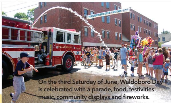
On the third Saturday of June, Waldoboro Day is celebrated with a parade, food, festivities, music, community displays and fireworks.

From artisans, clammers, restaurants, and manufacturers, Waldoboro is a town that wants to grow with your business.