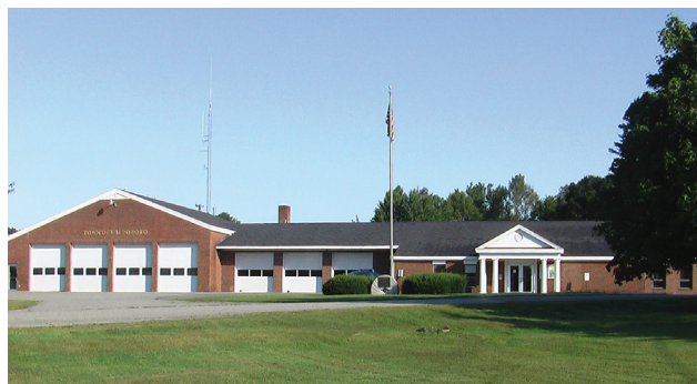
Waldoboro's municipal building houses all Town offices, as well as the Fire Department and Ambulance Services.

Waldoboro strives to ensure the public safety and care for its residents. Along with Town offices that will assist with any concerns during office hours, the municipal building also has 24-hour emergency services ready at a moment's notice.