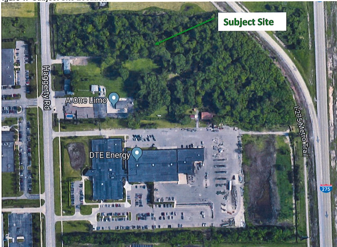
Figure 1. Subject Site Location

We have reviewed the application by DTE ASOC ("applicant") to rezone the following parcel illustrated on the map below from C-1 (General Business) to M-1 (Light Industrial). The site is located on the east side of Haggerty Road, just south of Ecorse Road and has a tax parcel identification number: V-125-83-046-99-0011-704. The parcel is mostly zoned M-1 with a narrow 82' wide x 595' deep piece on the north end, with frontage onto Haggerty and an area of 6.53 acres being zoned C-1. The applicant's request is to zone the "strip" of land to M – 1 designation.