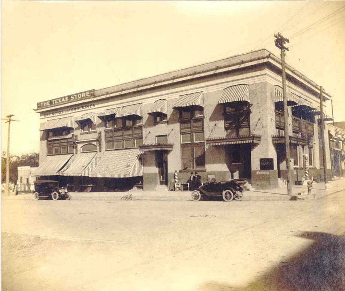
Figure 3. Temple State Bank and the Texas Store, c. 1915.

Temple Commercial Historic District Temple, Bell County, Texas