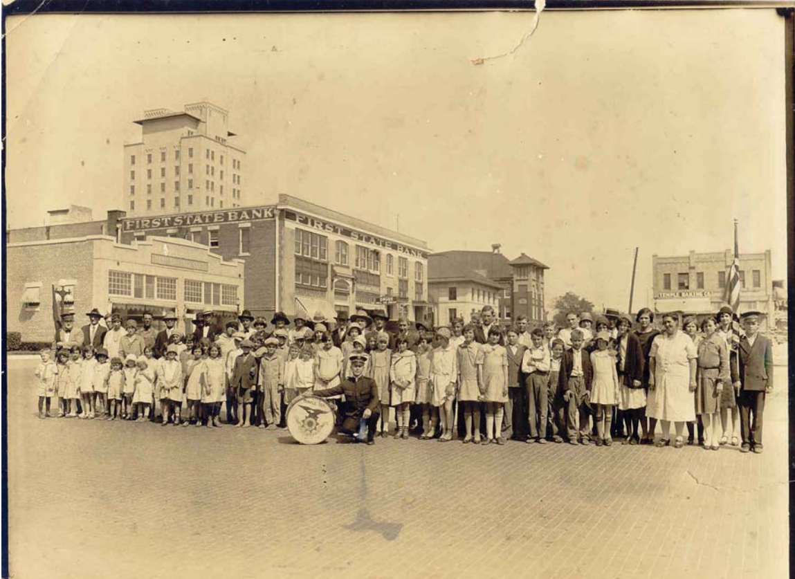
Figure 4. Group of Temple residents in downtown Temple, c. 1929.

Temple Commercial Historic District Temple, Bell County, Texas