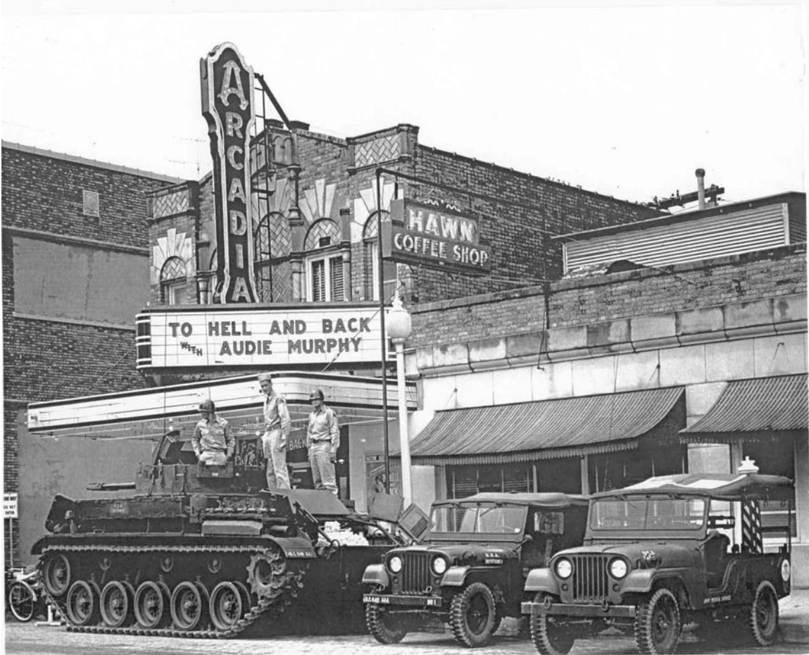
Figure 5. Arcadia Theater, c. 1945.

Temple Commercial Historic District Temple, Bell County, Texas