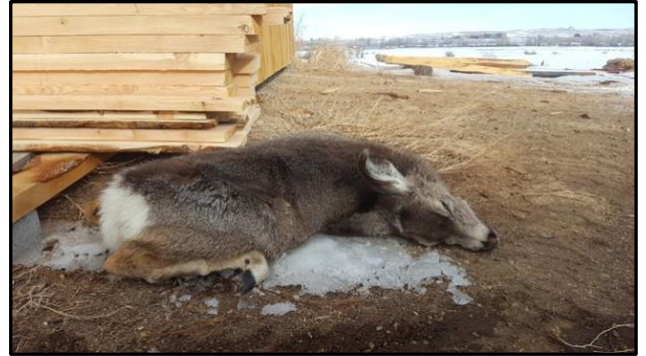
Mule deer dead from eating hay.

[This article was adapted from a Wyoming Game and Fish news release published earlier in 2023.]