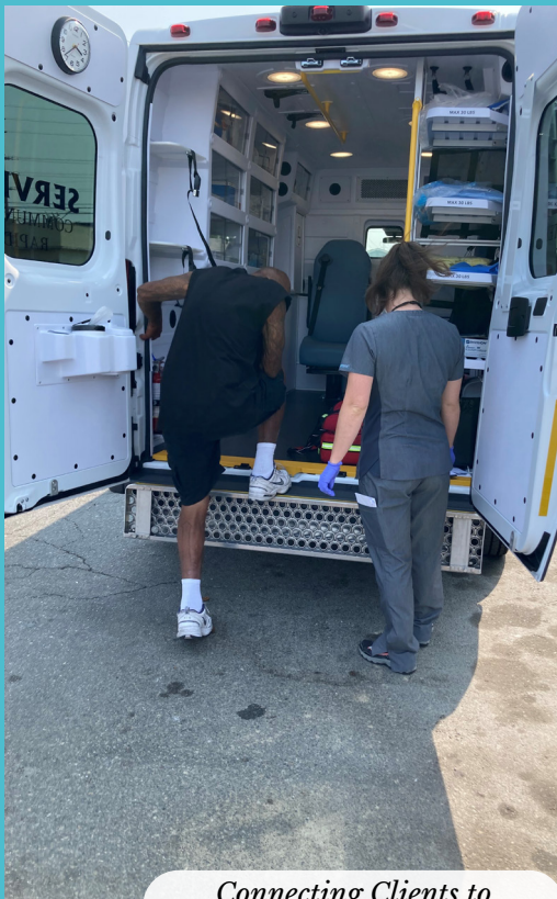
Connecting Clients to Healthcare Services

While responding to a call for assistance from OCSD on Monroe Avenue, Outreach Coordinators made contact with a man currently residing in a makeshift shelter located in the side of Bethel Romanian Pentecostal Apostolic Church. It was determined he met the criteria for Bridges at Kreamer Place and he was transported within one hour. Outreach Coordinator staff assisted with the clean-up of debris and tent removal.