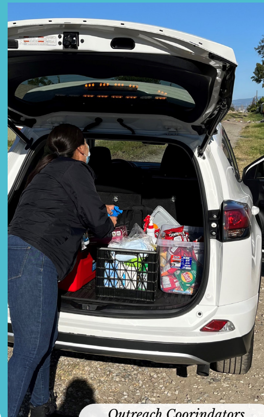
Outreach Coordinators Providing Basic Needs