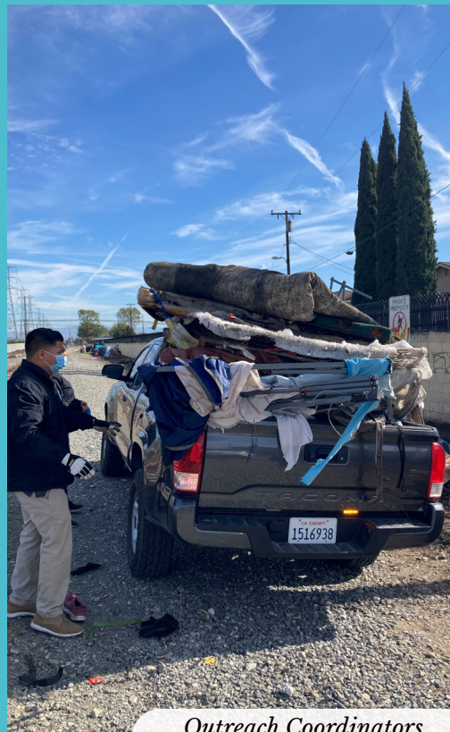
Outreach Coordinators Conducting Clean-up