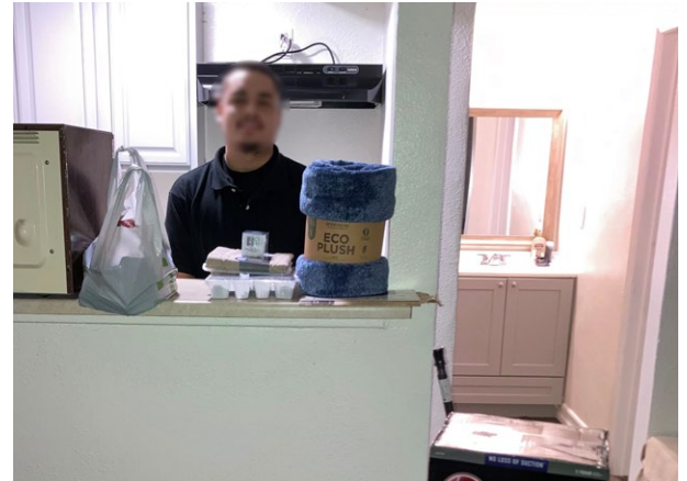
Participant in new housing unit.

Stanton Outreach Coordinators established and maintained contact with a transitional-aged participant (18-26 years old). The individual was a Stanton resident who had recently become homeless and was in dire need of housing assistance. The Outreach Coordinators collaborated with the Buena Park Navigation Center to place the participant in the shelter and connect the individual with additional resources. The Outreach Coordinators assisted the participant with the process of obtaining a housing subsidy from the County of Orange. As a result, the participant was matched to Orange County's Rapid Rehousing Program which allowed the participant to begin their housing search. The Outreach Coordinators provided Housing Navigation services to the participant to assist with locating a suitable unit. The Outreach Coordinators were successfully able to locate an ideal unit for the participant in Anaheim which allowed the participant to remain local.