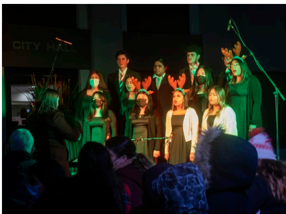
Rancho Alamitos choir performing at the Tree Lighting event.