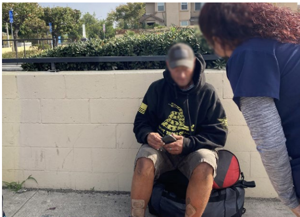
Making contact with one of the brothers.

While responding to a call for assistance from a concerned resident, the Outreach Coordinators engaged an elderly female participant who has been experiencing chronic homelessness. Based on the referral, the Outreach Coordinators began the process to connect the participant to County housing resources. Once the participant was evaluated, she was deemed appropriate for placement at the Buena Park Navigation Center. Equally important, the Outreach Coordinators completed a housing assessment and referred the elderly participant into the County community queue for Orange County funded housing. As a result, the participant was able to obtain supportive services that include housing, case management, and medical care.