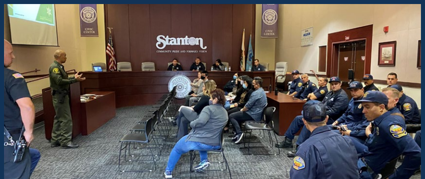
City Staff alongside with OCFA and OSCD members participated in the training.

Public Safety has scheduled an Active Shooter Training for City employees. The City will partner with OCSD and OCFA to deliver a presentation on Thursday, December 9, designed to give employees useful tools in the unlikely event of a workplace incident.