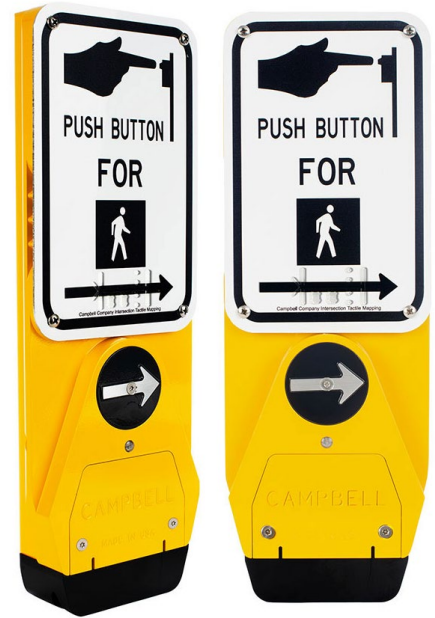
Example of the new pedestrian push buttons.

After nearly six months of waiting for parts to arrive from overseas, Econolite Systems, Inc. started on the 2021 Citywide Traffic Signal Equipment Improvements project on January 4th. This project will replace many outdated traffic signal controllers, pedestrian signal displays with countdown LED displays and smaller pedestrian push buttons (2" diameter) that is in compliance with the Americans with Disabilities Act and upgrade some overhead safety lights at signalized intersections to LED lights. The City Engineer is also working with the City of Cypress to install an audible pedestrian signal (APS) at Katalla and Knott in response to a written request from a legally blind resident; however, these APS signals are also on backorder and may not be available until the Spring.