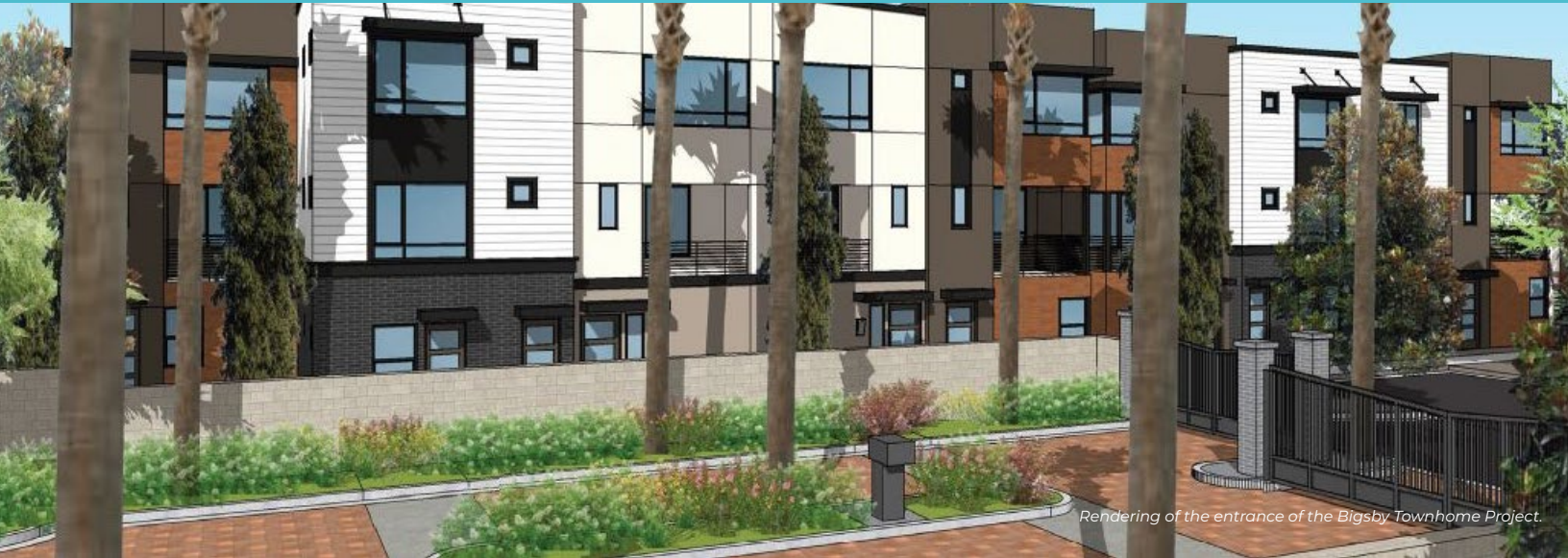
Rendering of the entrance of the Bigsby Townhome Project.