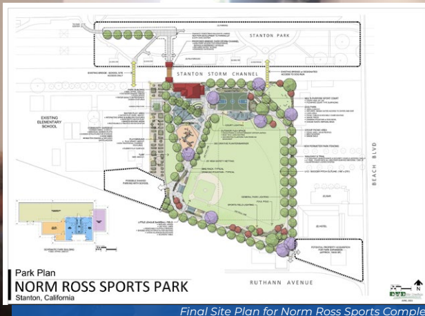
Final Site Plan for Norm Ross Sports Complex