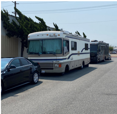
Motorhomes parked on Pacific Avenue