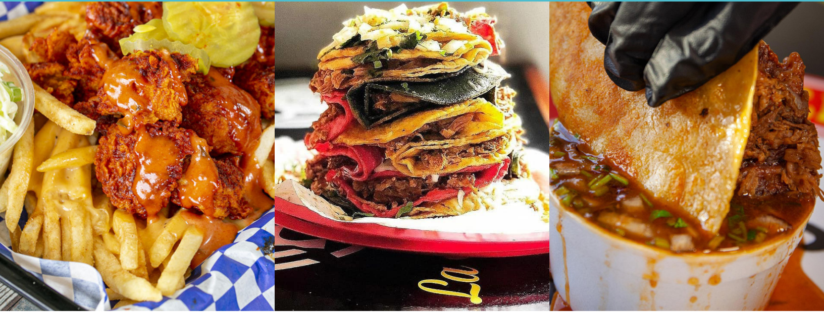
Food from Legend Hot Chicken, La Super Birria, and Birrieria Guadalajara