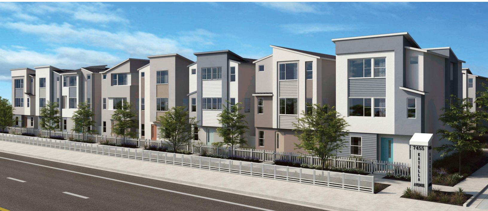
KATELLA AVENUE STREET SCENE

On June 16, 2021 the Planning Commission conducted a public hearing for KB Home's proposed 36 united detached condominium project. After hearing public comment and asking questions of staff and the applicant, the Commission concluded that they would recommend approval to City Council if the following three areas of the project were addressed: a 25% reduction in 4 bedroom units, alternative solutions for ingress and egress on Katella Avenue and architectural improvements. Staff will review the revised plans once the applicant resubmits and will prepare for City Council public hearing on July 27.