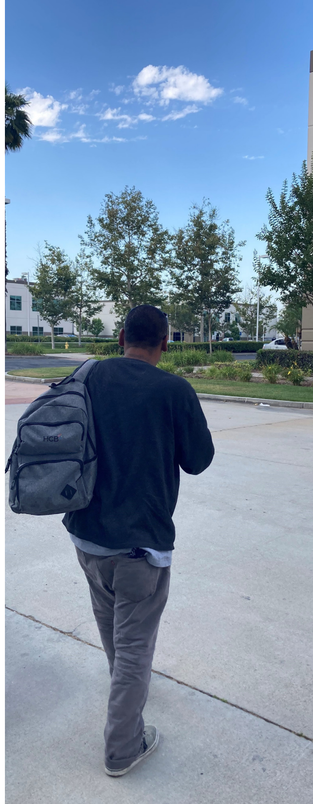
Outreach Coordinator Client