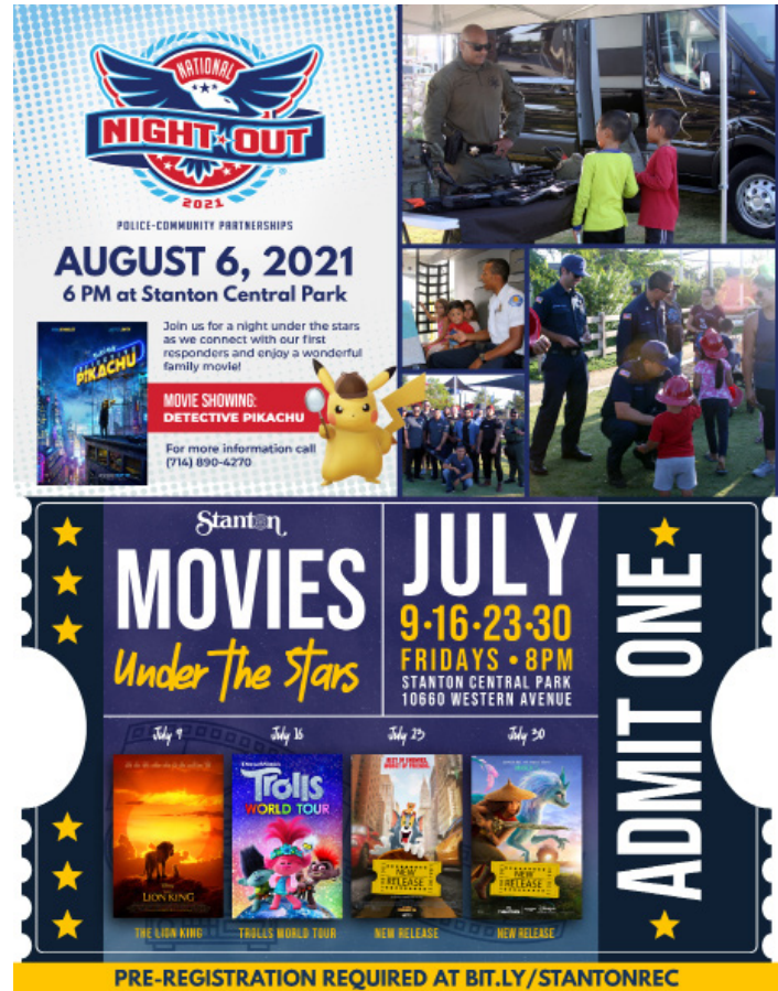
Flyers for our upcoming summer events

Celebrate Parks Make Life Better month with us! Please see the attached calendar that is also in the Summer Stanton Express for a variety of recreation activities. Staff also launched a photo and drawing contest for the community to tell us why parks make their lives better, with the opportunity to win a variety of prizes. Be on the lookout for signs around Stanton Central Park pointing out our most photogenic spaces!