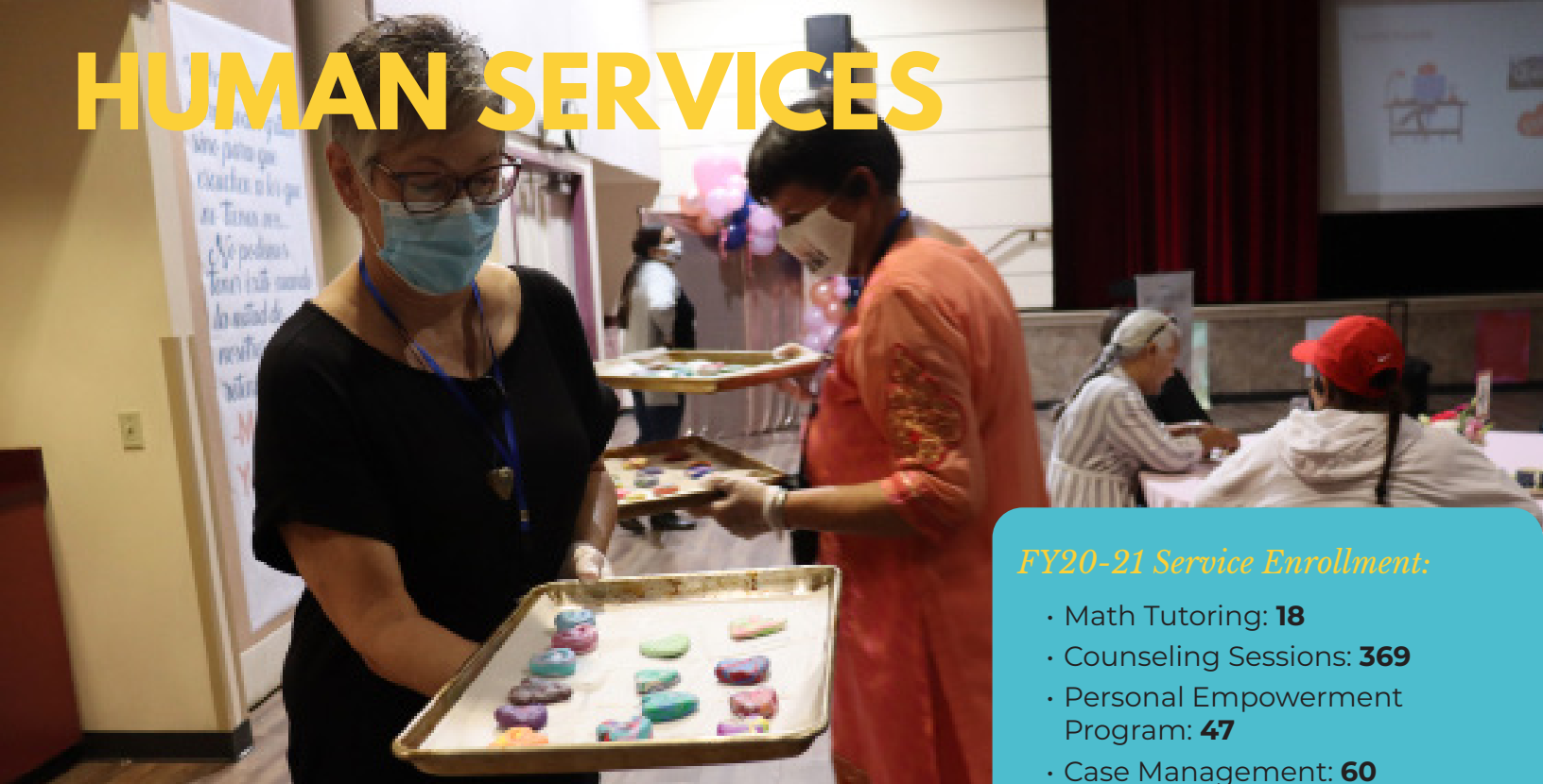
Participants at our Women's Day event shows off their craft