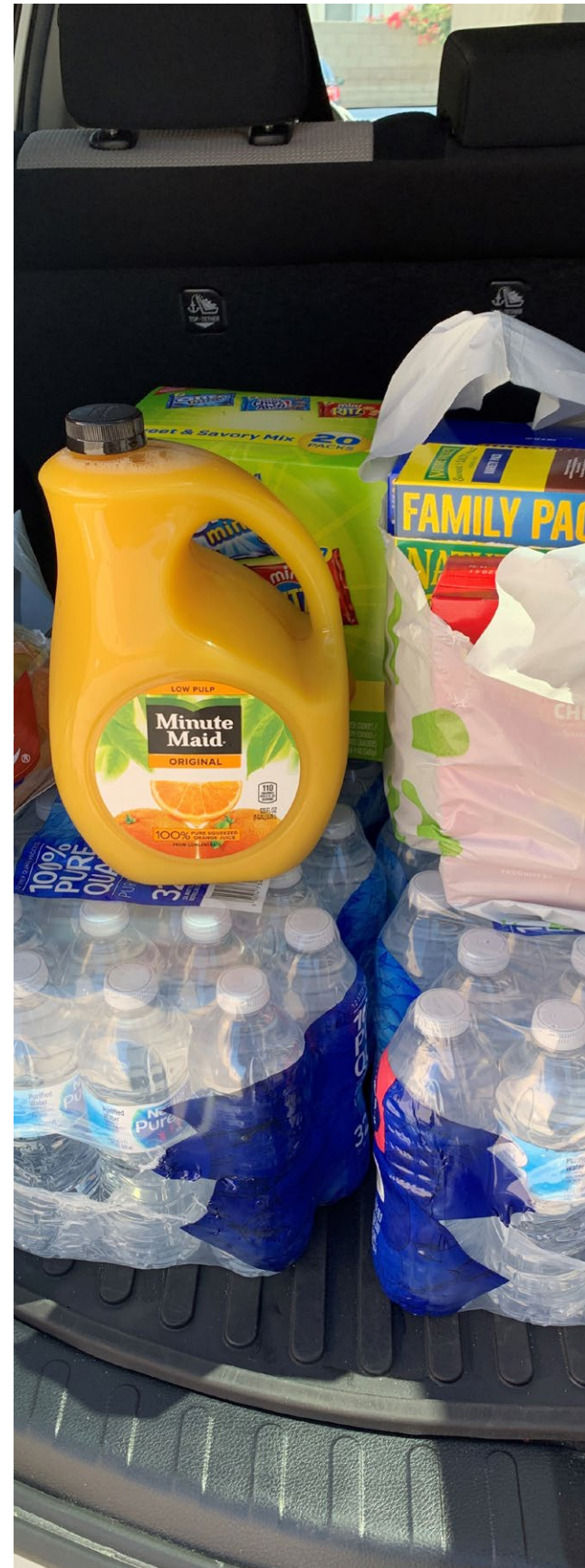
Items provided to the family in need