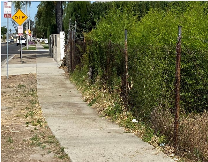
After the overgrown vegetation was cleared

Code Enforcement has begun its illegal fireworks campaign with the assistance of the City PIO. Messages regarding the use of illegal fireworks can already be seen on City message boards and signs are being distributed to interested parties. Additionally, customized door hangers will be distributed by staff in previously identified high-use areas that warn individuals about the consequences of using illegal fireworks.