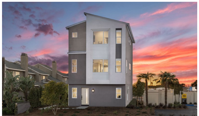
Rendering of Lighthouse residential development

You may have seen framing on-site just north of Katella and west of Western Avenue. Grading is complete, foundations are set and framing is underway for 20 Single-family units. The construction team is working to prepare 10 more units for footing inspections. The community will soon see more framing happening as this project continues to take shape.