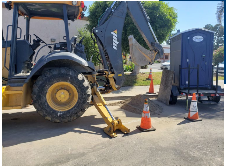
Inspections during the night and daytime by City Staff

Staff has been conducting inspections for various projects around the city. One of these includes night inspections for Southern California Edison for the replacement of high voltage power poles. This work was conducted at night due to the concerns of power outages. Power outages at night minimize the effects to nearby neighborhoods and commercial areas. In a separate project, staff noticed many code violations and temporarily suspended any construction activity until corrections were made.