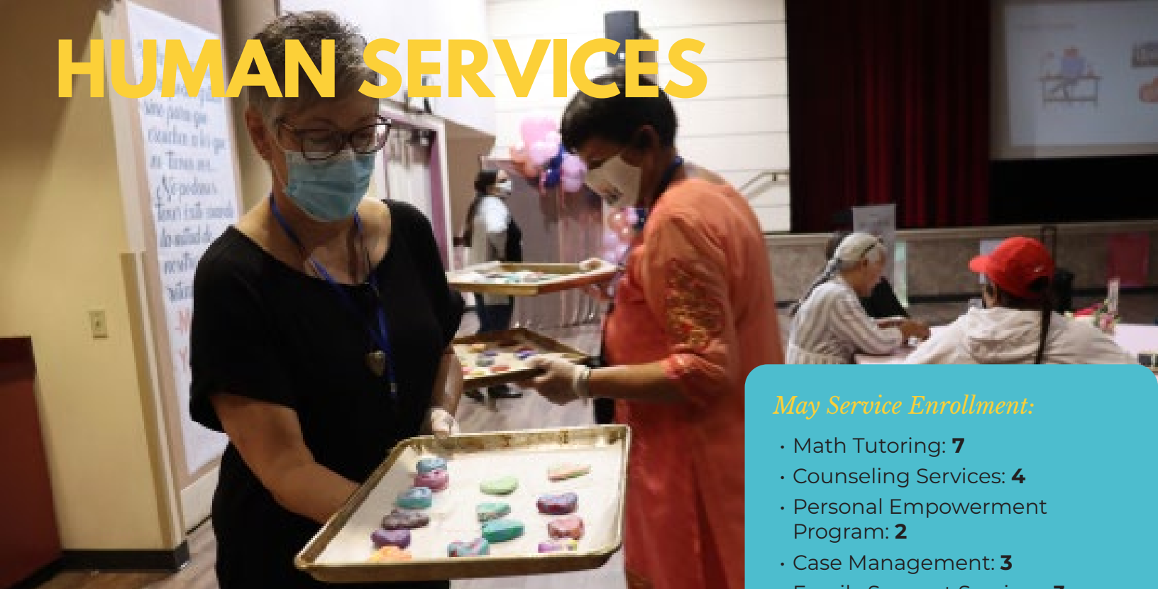
Participants at our Women's Day event shows off their craft