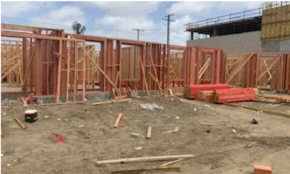
Framing being put up at VRV development

This project continues to take shape. Segment 4 for the slab on grade and post-tension cables for the apartment building is complete and framing has begun for segments 2 and 3. You probably have noticed a crane on site. Moment-resisting framing was being hung and 4 th level deck of the parking structure is underway.