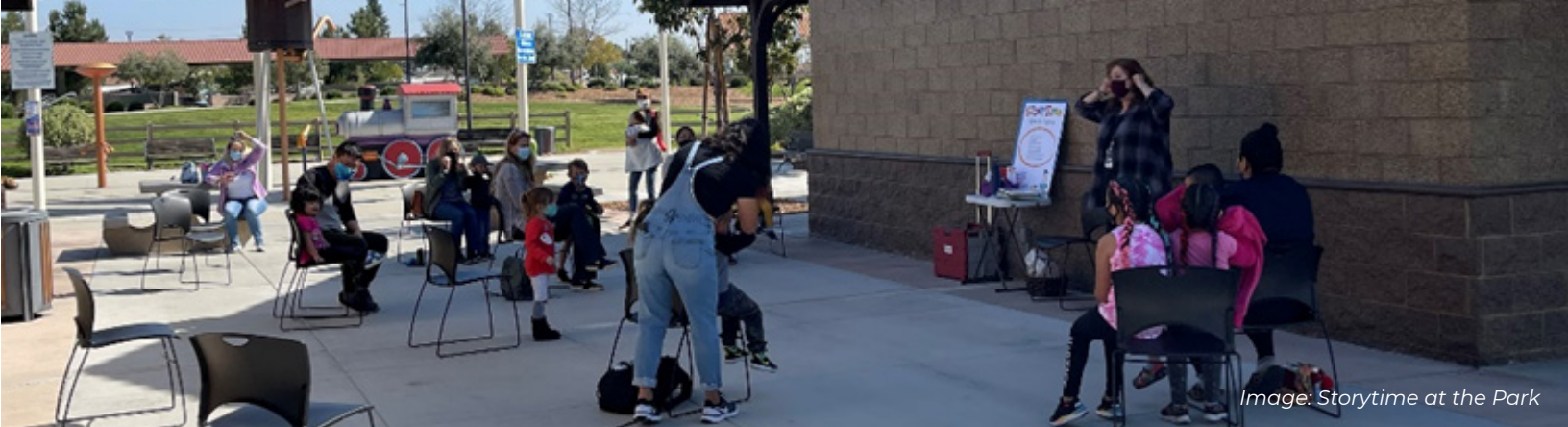
Image: Storytime at the Park