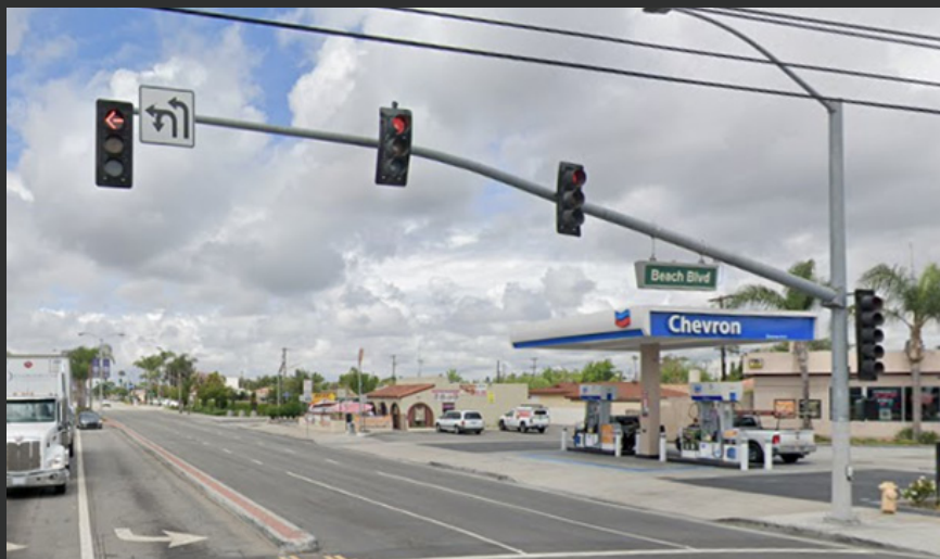
Image: Traffic Signals on Beach Blvd.

This project is to be awarded on April 13 th during the City Council meeting. The FY 20/21 Citywide Traffic Signal Equipment Improvements will affect all signals within city limits. This will greatly improve traffic flow and reduce wait times at busy intersections. New cabinets with battery backups will be installed at every city signal. This will prevent a signal from going completely dark in an outage.