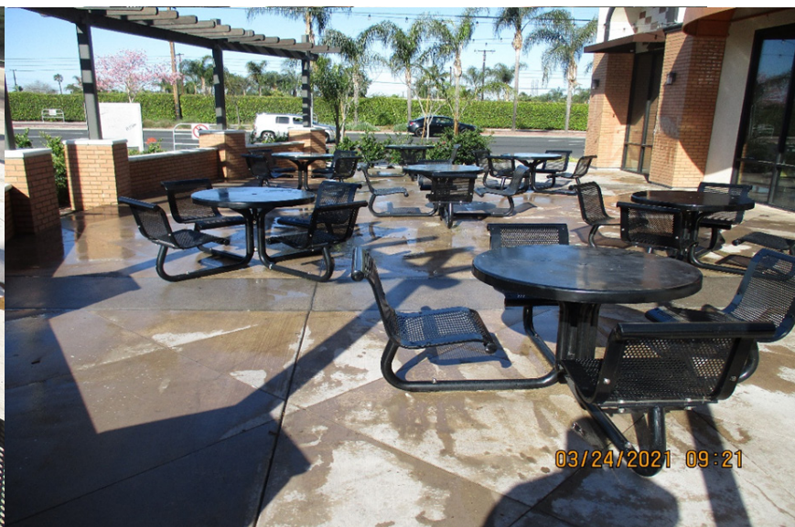
Image: Vandalism on tables at Hiccups (Left) and the result of the clean-up efforts (Right).