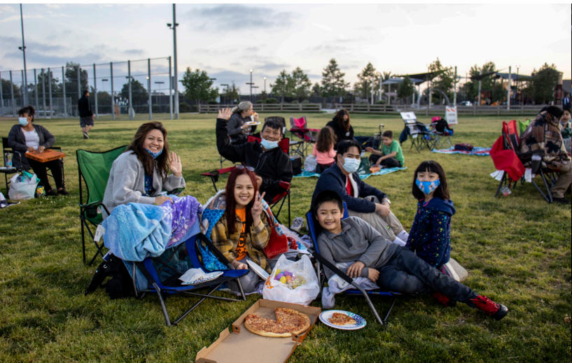
Image: Family enjoying Little Caesars Pizza