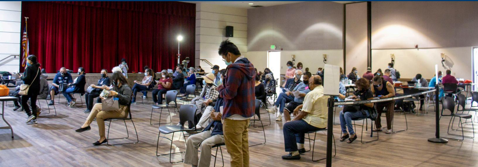
Image: Patients waiting after receiving their vaccination to ensure that they don't have any immediate side effects.

On March 30 th , the City hosted a Mobile Point of Dispensing (POD) clinic to disseminate Coronavirus vaccines to the community. With the help of the Community Services Department, 50 of the most vulnerable members of the community were prioritized and received the vaccine.