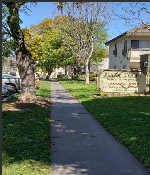
Image: Raised sidewalk on Jane Way & Court Ave.

Several massive trees on Court Avenue and Jane Way Avenue have caused severe uplifting to city-owned residential sidewalks. This project will address any tripping hazards located within this community. Inspection has been performed and currently, a proposal for this project is being generated.