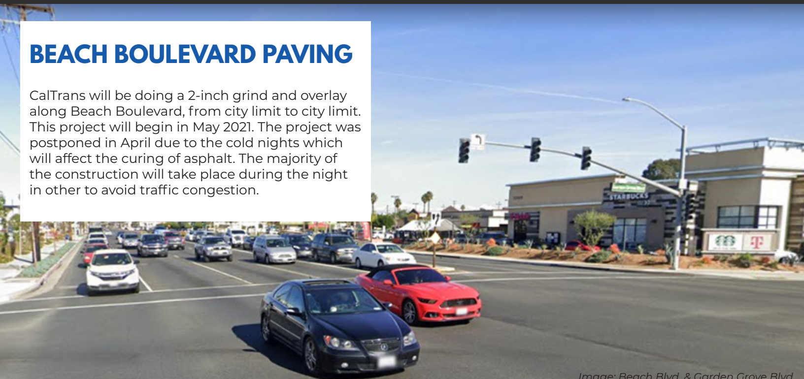
Image: Beach Blvd. & Garden Grove Blvd.

CalTrans will be doing a 2-inch grind and overlay along Beach Boulevard, from city limit to city limit. This project will begin in May 2021. The project was postponed in April due to the cold nights which will affect the curing of asphalt. The majority of the construction will take place during the night in order to avoid traffic congestion.