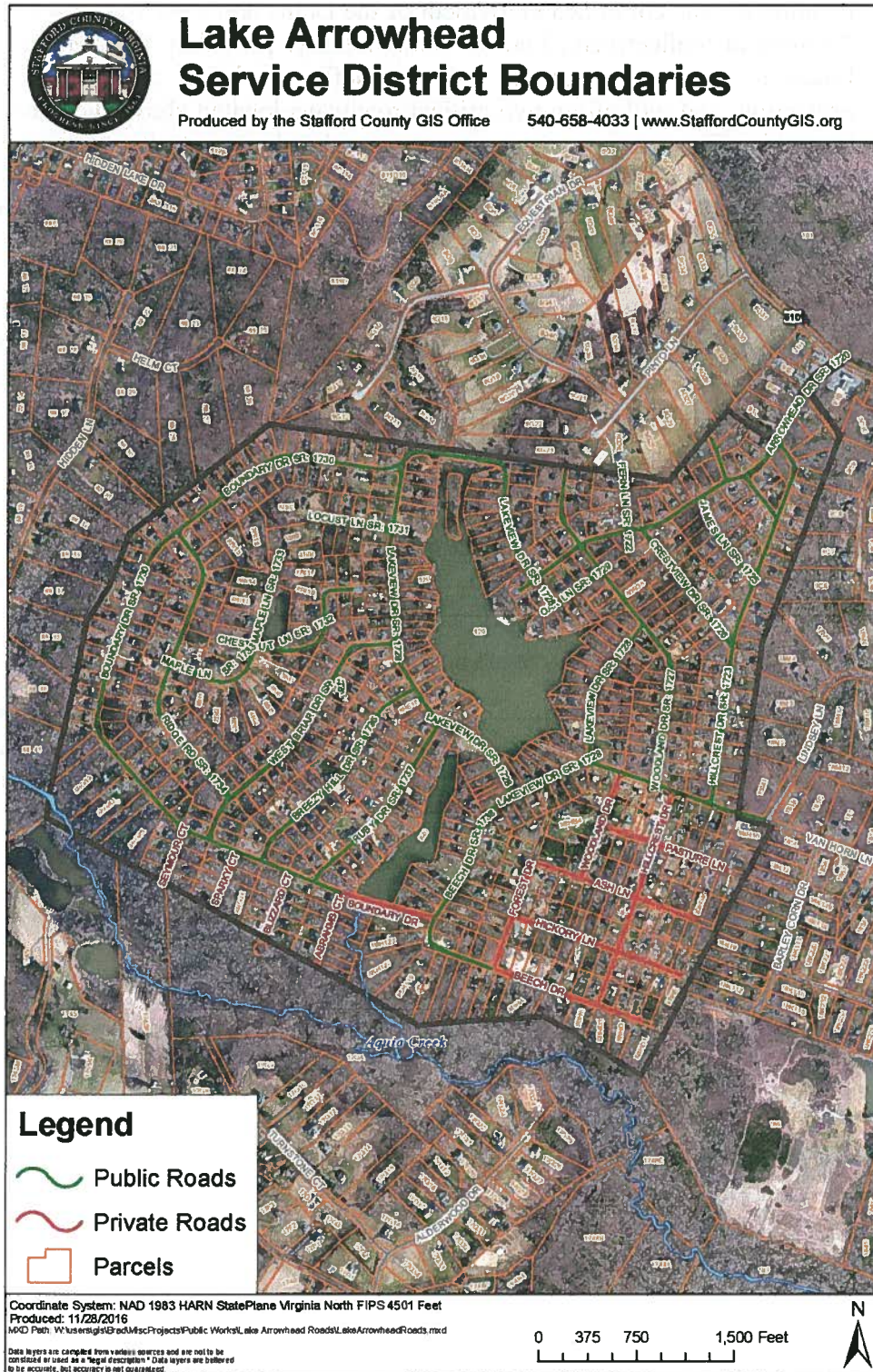
Map of the Lake Arrowhead Service District Boundaries.