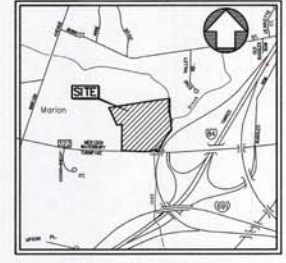
LOCATION MAP GRAPHICAL SCALE: 1"=1000'