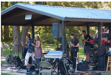
Blonde, James Blonde June 16, 2021