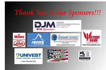
2021 Concert Sponsors