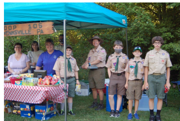
Boy Scouts Troop 105