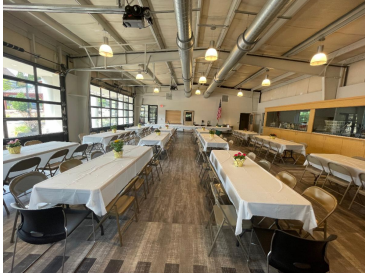
First Private Event in Community Room