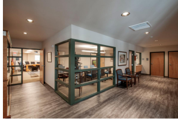
View of Conference Room and Borough Council Chambers