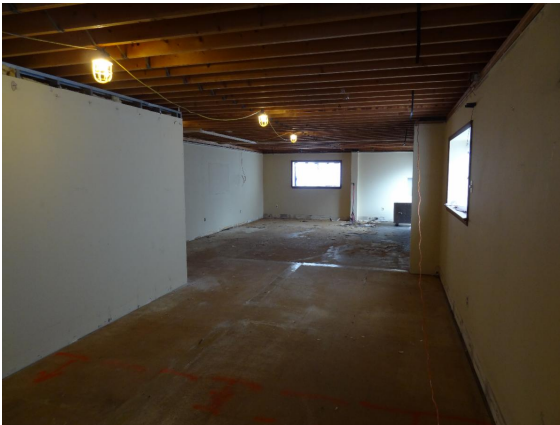
Interior view of the future administrative area at 300 Main Street.