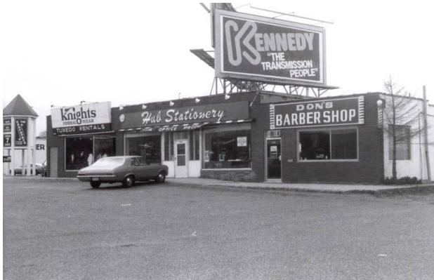
Historic Photos of Richfield