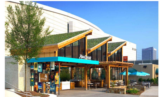
Green Roof Example

Sustainable building design is an important way to reduce environmental impacts and increase overall design character of the community. Sustainable design of buildings focuses on utilizing renewable and local resources, reducing energy consumption and limiting impacts to the surrounding natural environment.