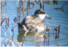
Ruddy Duck, winter plumage