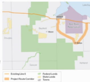
Enbridge's proposed reroute