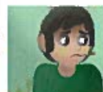
Minookoz (minookoz - minookoz) I am sad