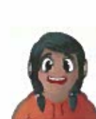
Minwendan (minwenda - minwenda) I like things