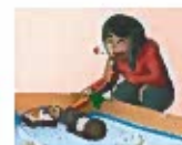
Ningishewoodiz (ningishewoodiz - ningishewoodiz) I am angry