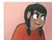
Minishkoodiz (minishkoodiz - minishkoodiz) I am sad