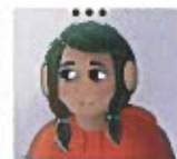
Minoyekoz (minoyekoz - minoyekoz) I am tired