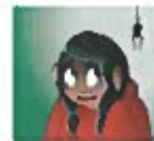
Minosh (minosh - minosh) I am happy