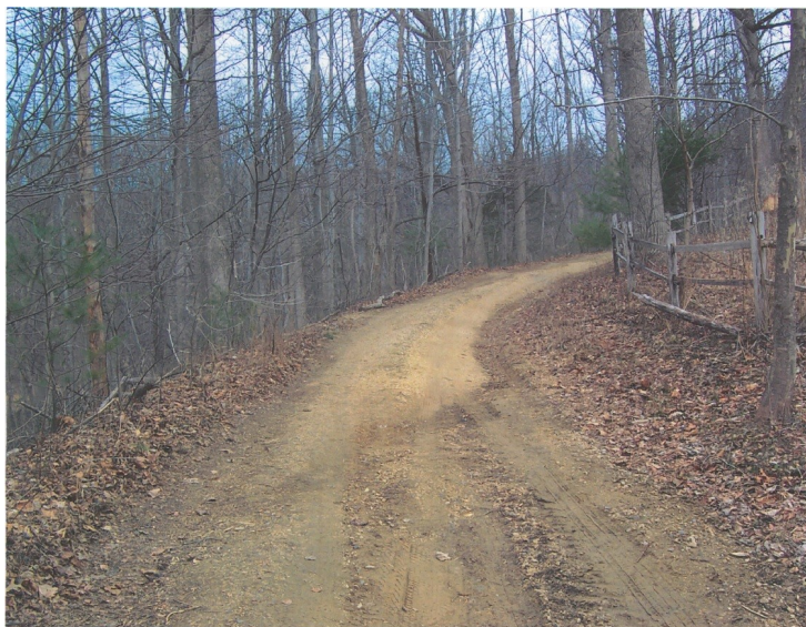
A poorly shaped road section that allows runoff to flow down the road bed.

Best Management Practices (BMPs) can be integrated with the road and ditch design to reduce erosion, flooding, and maintenance costs. See the Resources Section at the end of this chapter for detailed guides to driveway best management practices.