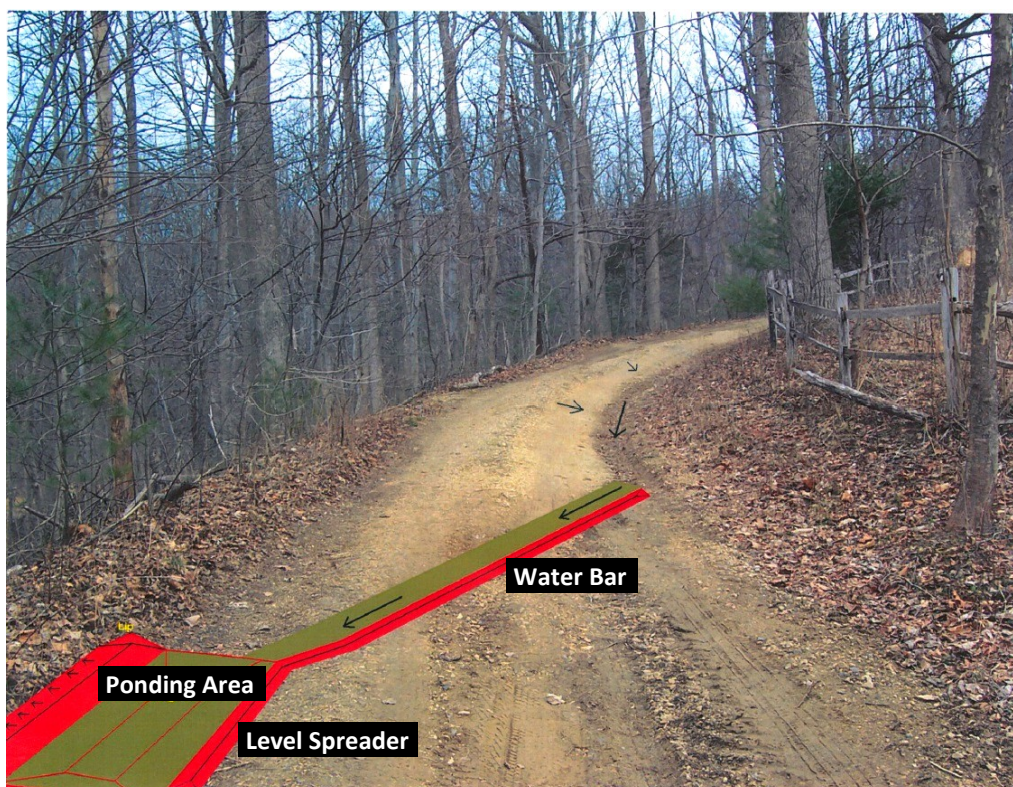
Possible Solution: Re-grade the roadbed with a crown, apply proper roadbed materials (gravel base), and install side ditches or rock check dams.