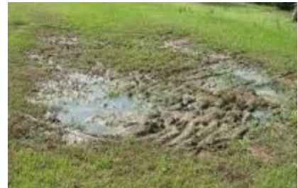
Sewage overflow due to failed septic system.

Maintaining your septic system also provides health and environmental savings. Poorly treated sewage from a failing system can seep into the groundwater, bringing with it bacteria, viruses and toxic chemicals. This pollution not only affects well users, however. As the contaminated groundwater makes its way into local streams and lakes, other users suffer. For example, swimmers can contract diseases ranging from eye and ear infections, to acute gastrointestinal illness and hepatitis. The downstream ecosystem also suffers, particularly aquatic plants, animals and shellfish, but also land animals such as pets that drink the contaminated water. Cleanup of the contamination is exceedingly difficult and far more expensive than prevention.