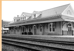
Orange Historic Train Depot

"Exploring our Heritage on the Constitution Highway"