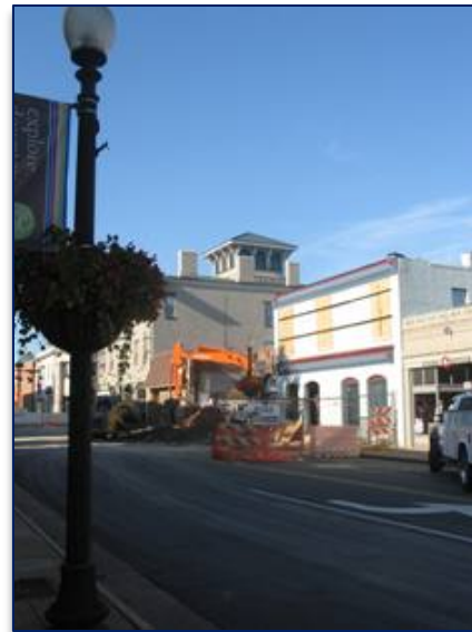
The historic Ritz Hi-Hat building in downtown Culpeper, Virginia was destroyed by the August 23, 2011 earthquake. The picture above shows the demolition and removal phase one week after the earthquake.