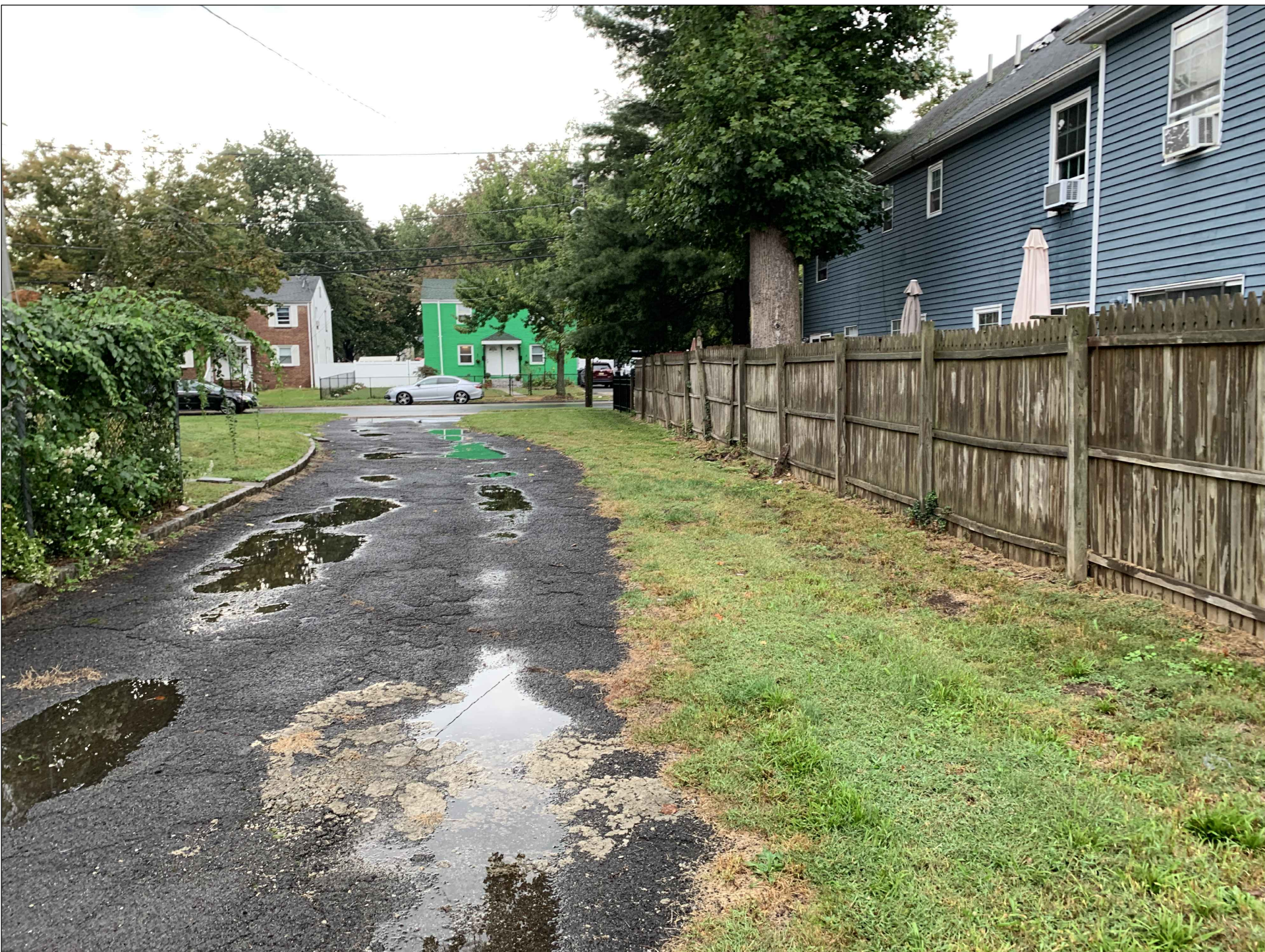
3 IMAGE 3 - LOOKING WEST TOWARDS E. FRONT STREET Scale: N.T.S.