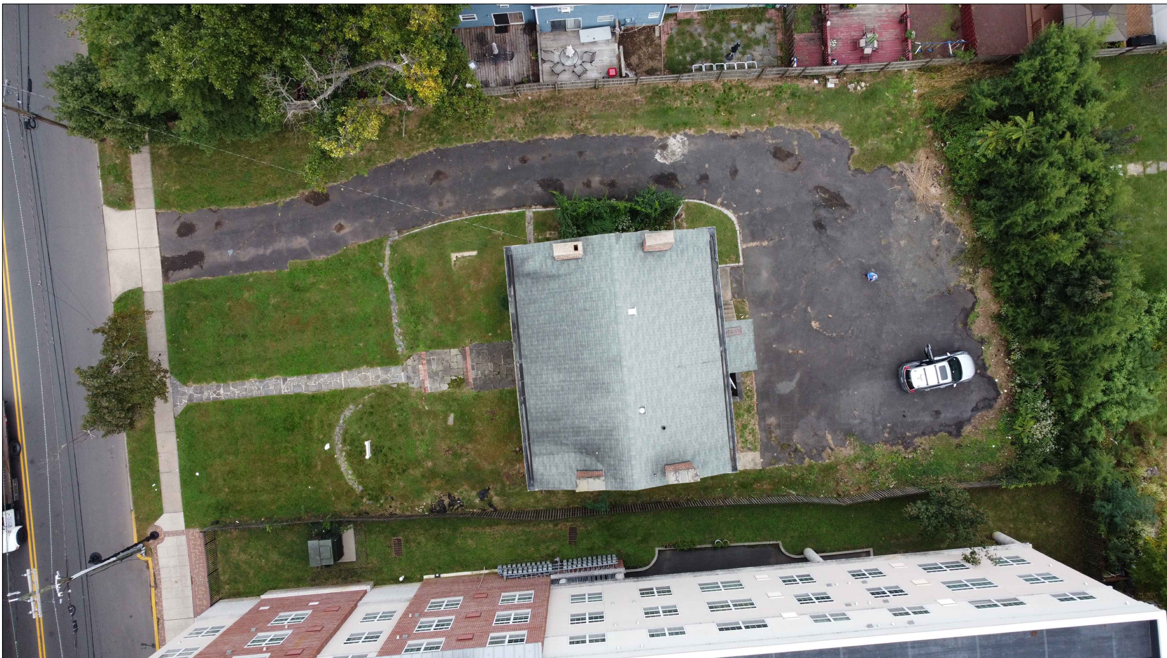
4 IMAGE 4 - AERIAL VIEW OF SITE Scale: N.T.S.