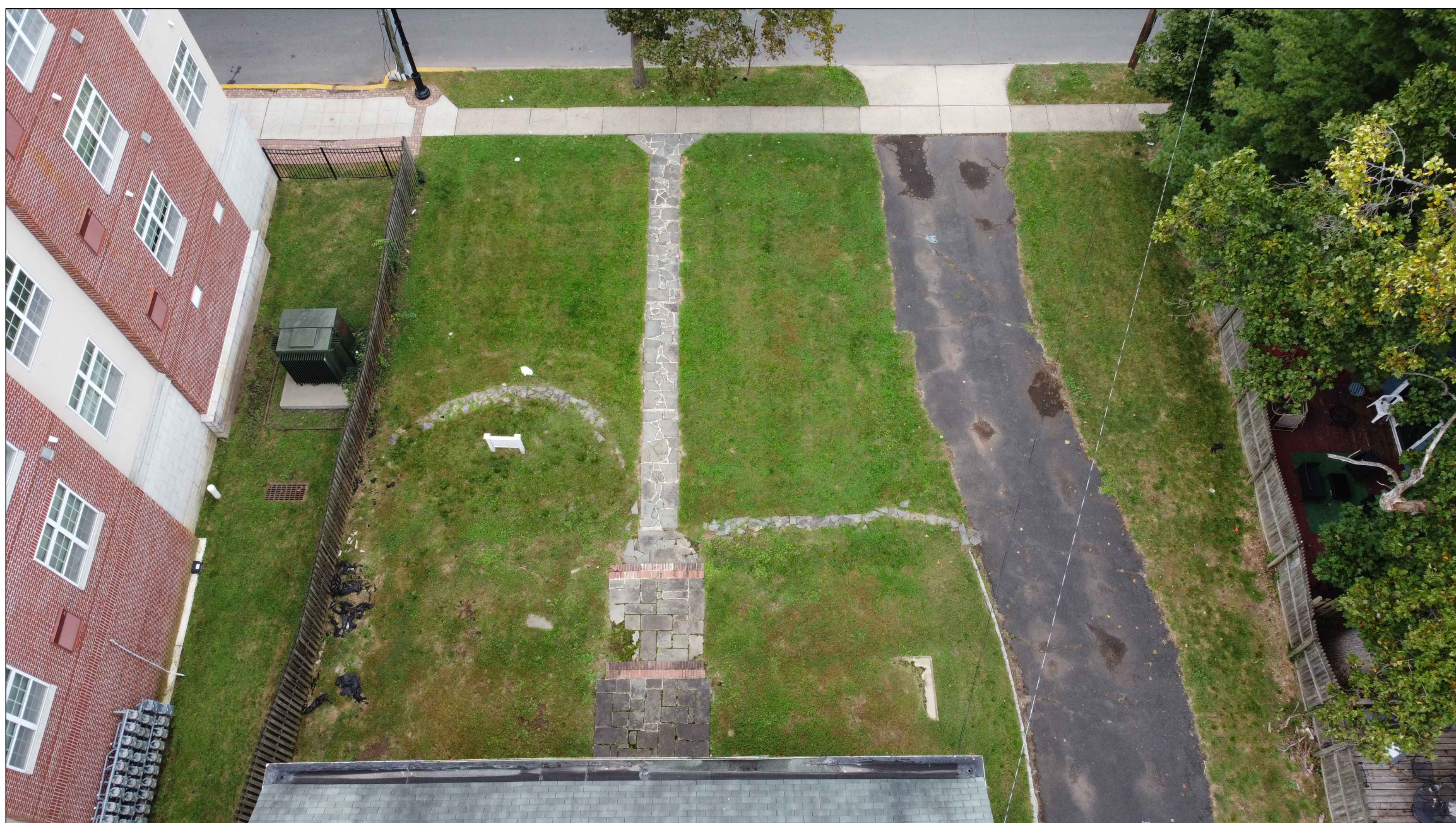
6 IMAGE 6 - FRONT YARD OF SITE Scale: N.T.S.