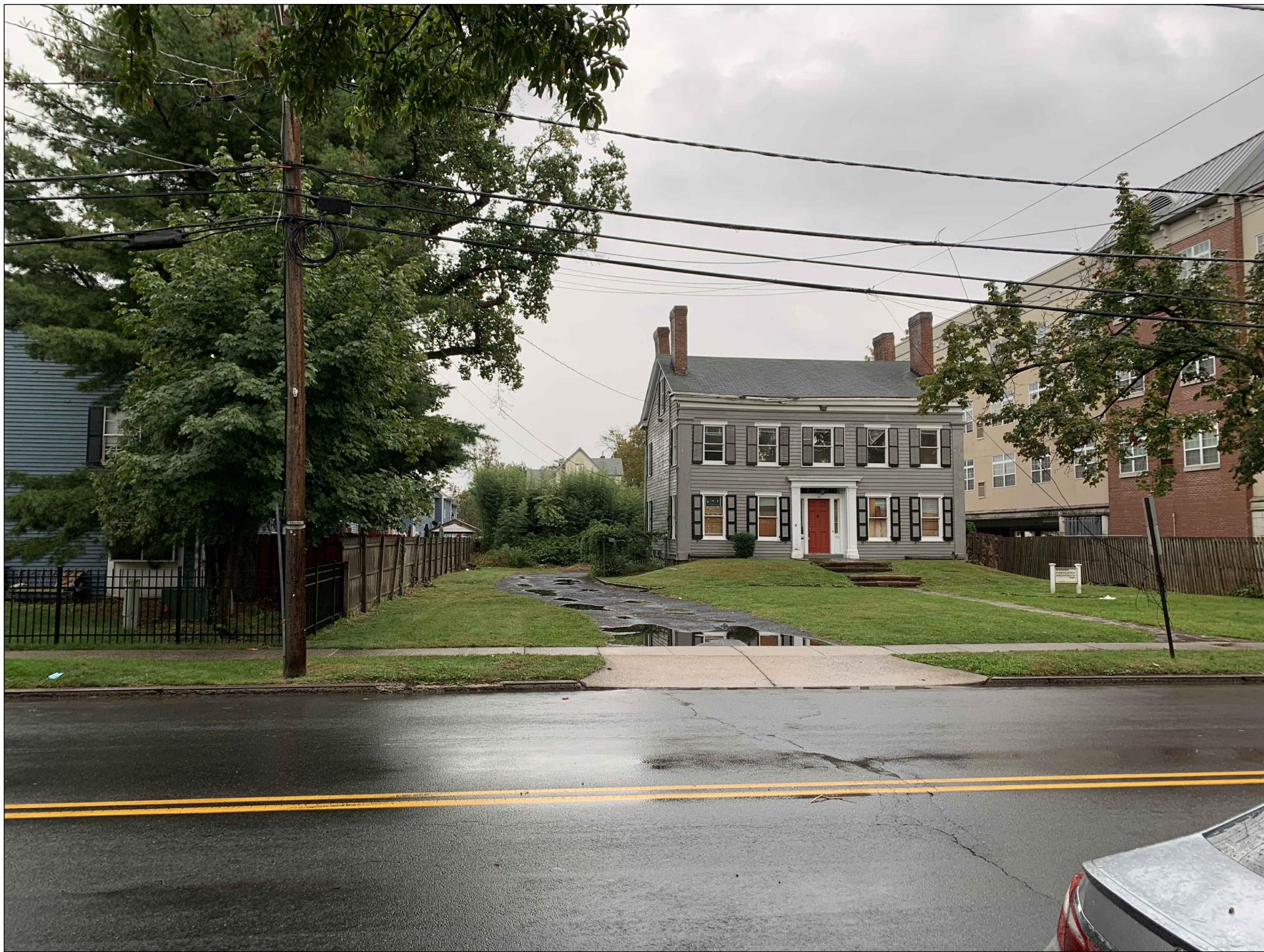
1 IMAGE 1 - VIEW OF SITE FROM E. FRONT STREET Scale: N.T.S.