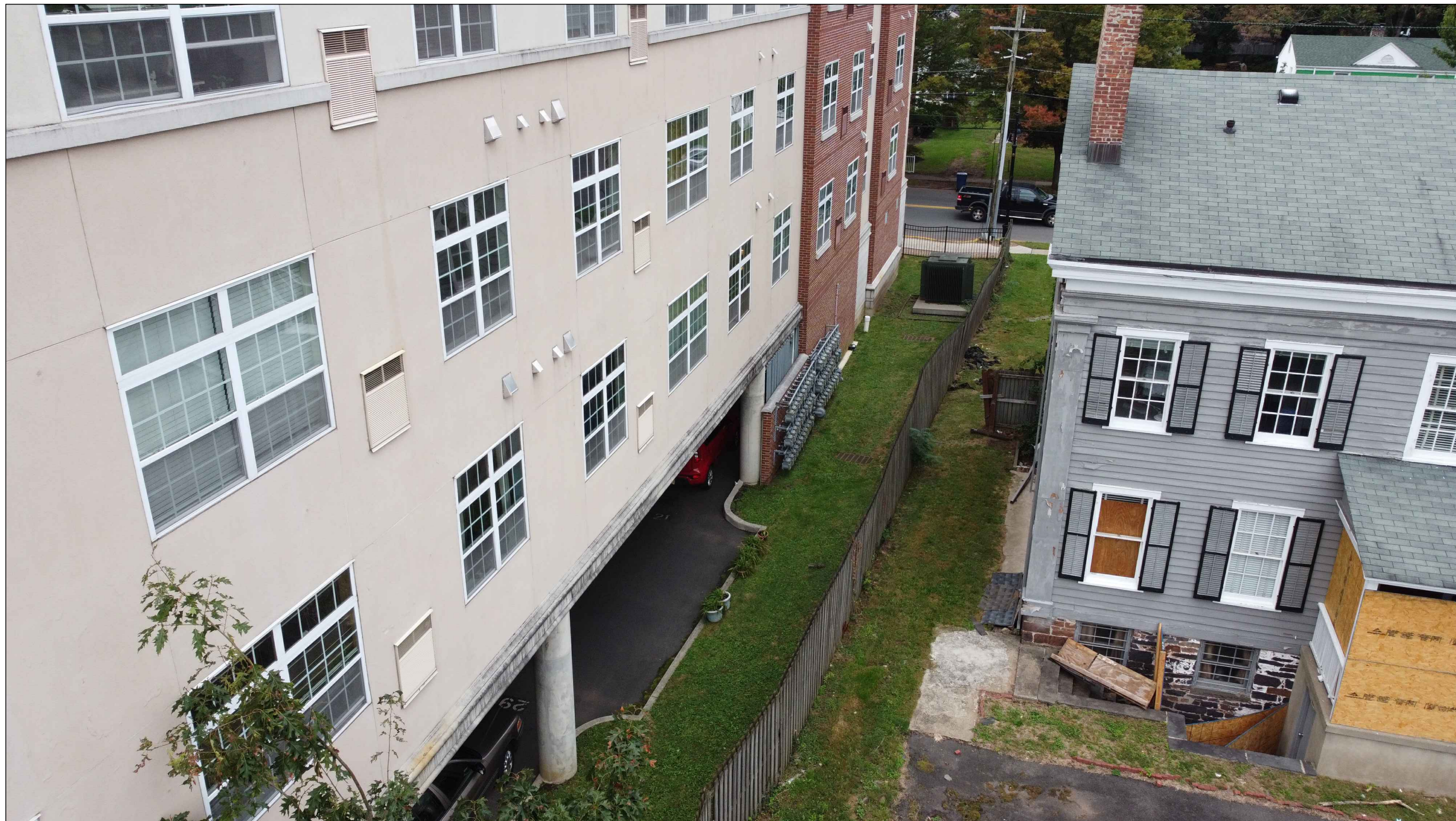
2 IMAGE 2 - SOUTH PROPERTY LINE Scale: N.T.S.