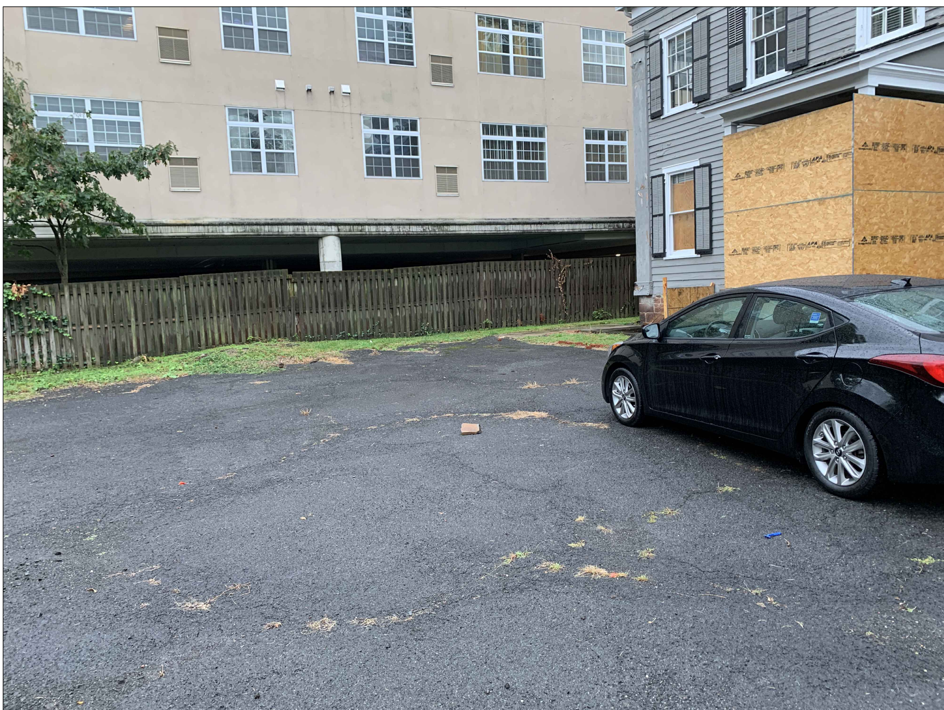
5 IMAGE 5 - EXISTING BACK YARD LOOKING SOUTH Scale: N.T.S.