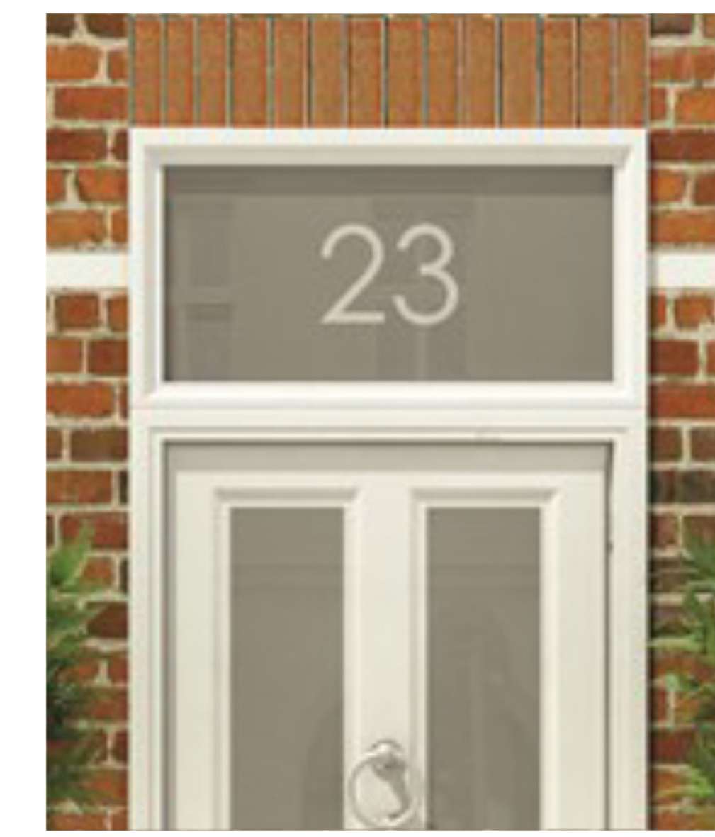
3 BUILDING NUMBER PRECEDENT SCALE: NTS