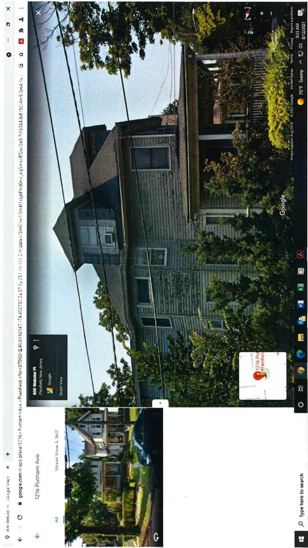
Slate covered dormer on Webster Place side of 1216 Putnam Avenue