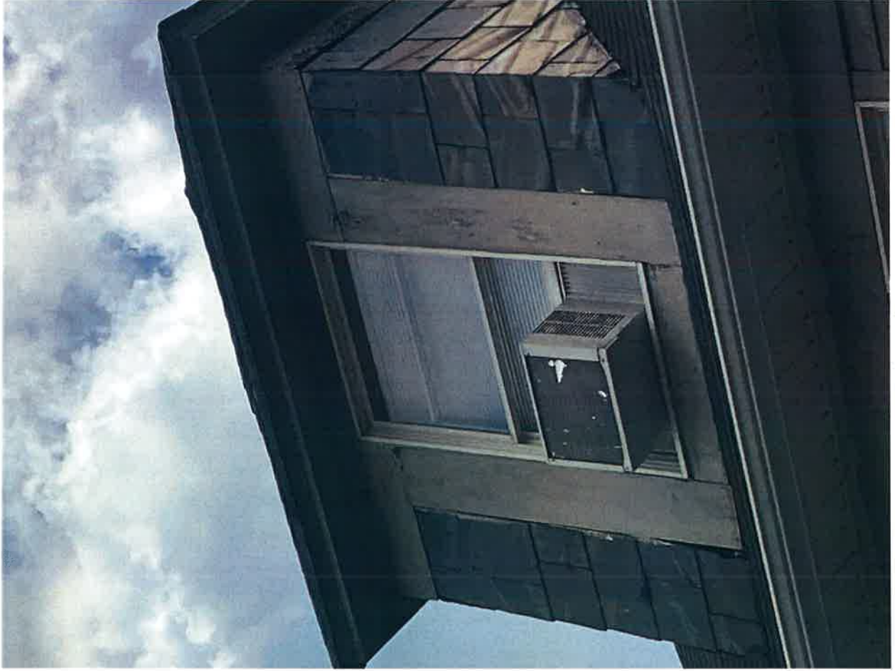
close up view of slate dormer