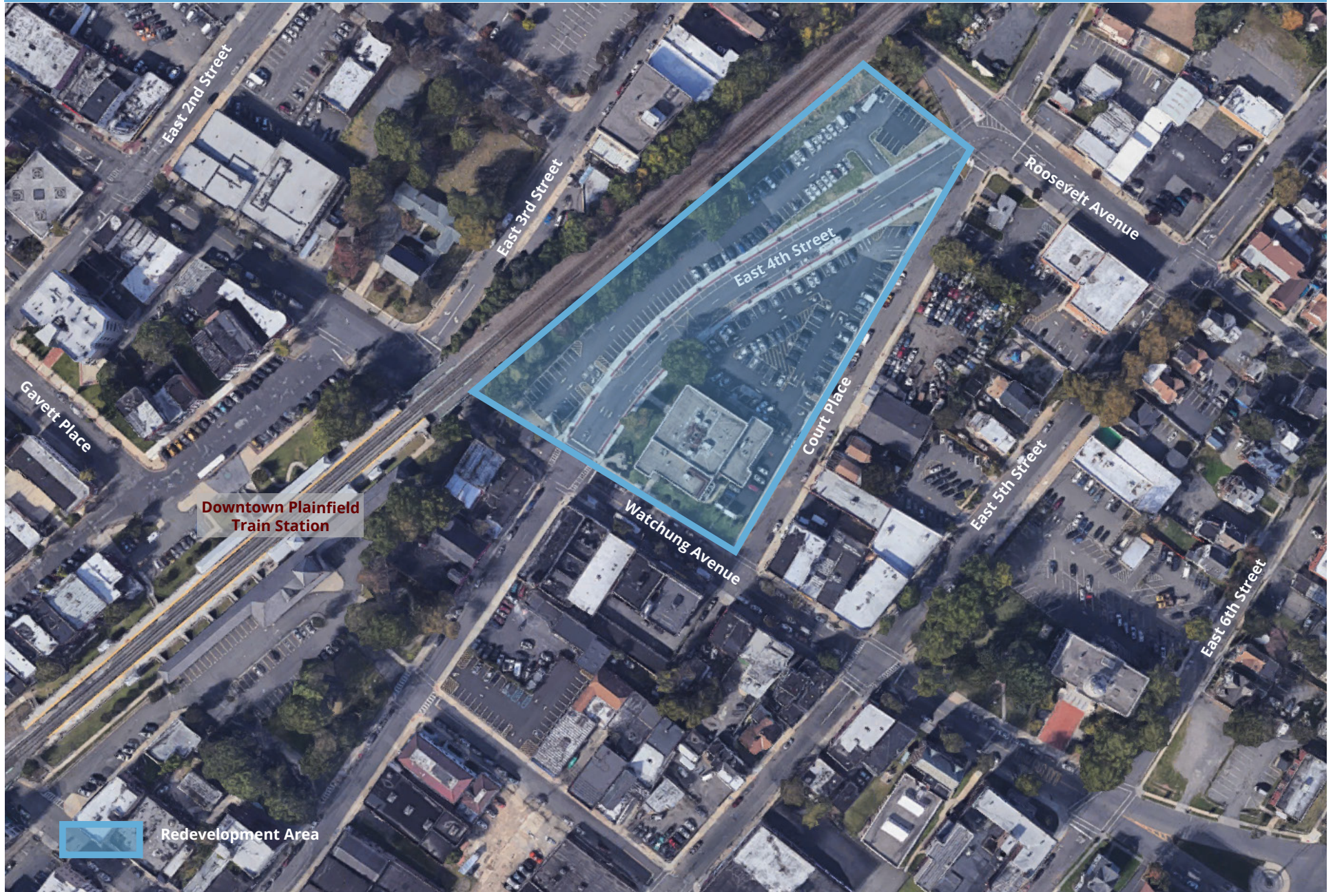
Map 1: Redevelopment Area