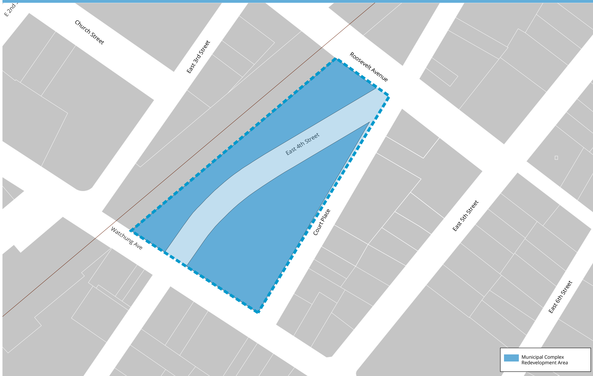
Map 5: Proposed Land Use Plan