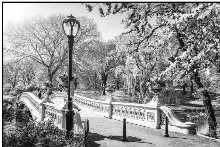
An artist's rendering of the conceptual bridge for Piscataway Ecological Park

As always, please call my office at (732) 562-2301 if I may ever be of assistance to you.