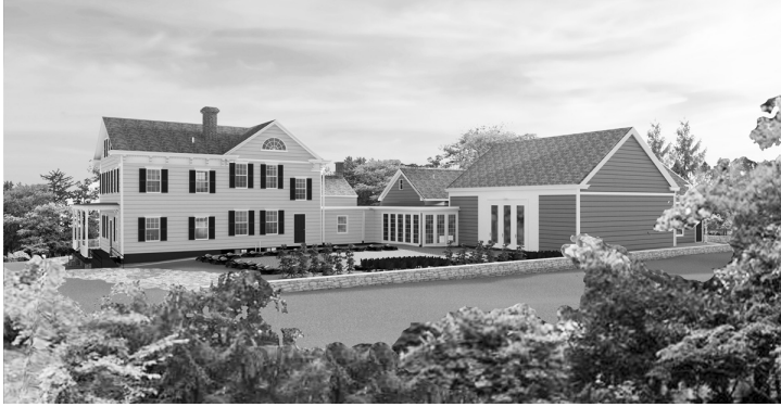
An artist's rendering of the Metlar-Bodine House Museum with the Forever the 4 th Gallery that will house the Ross Hall Wall