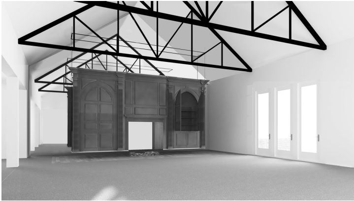
The planned interior of the Forever the 4 th Gallery that will display the Ross Hall Wall at the Metlar-Bodine House Museum

Independence Day in Piscataway, make sure to tag your social media posts with #First4th.