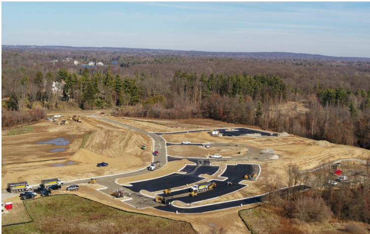
Paving of the Road