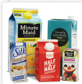
Cartons (caps on)