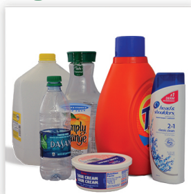
Plastic Bottles and containers (#1, #2, #4-7)