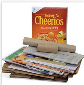
Office & Mixed Paper, Newspaper, Magazines & Flattened Cardboard (pizza boxes clean of food acceptable)