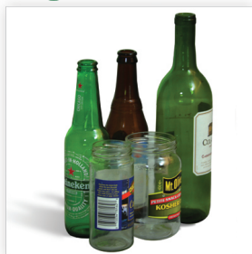
Bottles and Jars