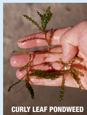
CURLY LEAF PONDWEED