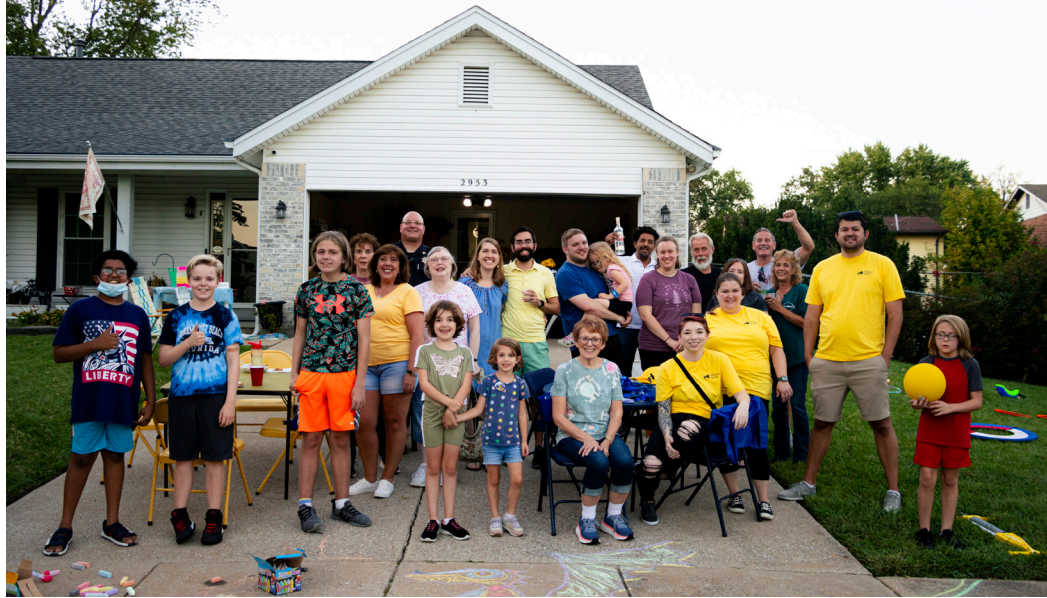
City residents and staff pose for a photo at a 2022 MHNO block party.

This publication is produced by the City of Maryland Heights Communications Division. Contact them by emailing mhlife@marylandheights.com .