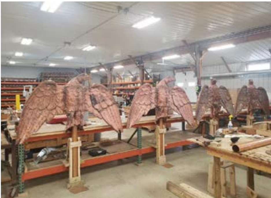
Eagles ready to be installed in Spring 2022.