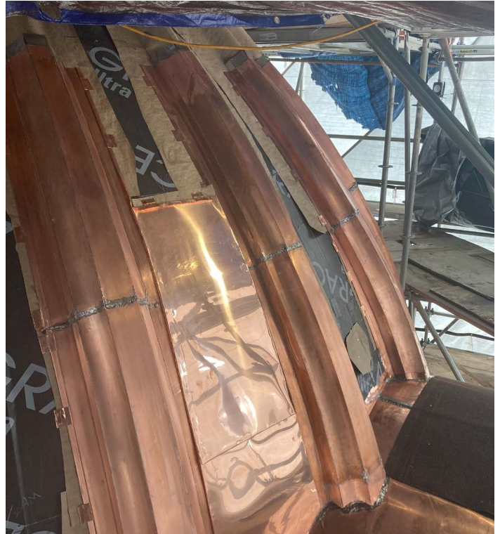
Copper secondary ribs on the dome.