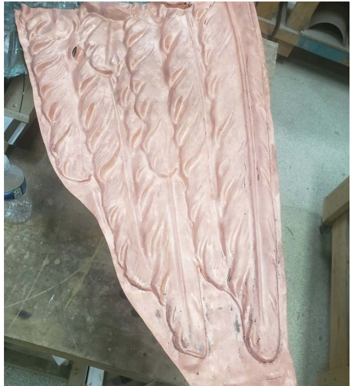
The first copper stamping of the eagle wing portions.