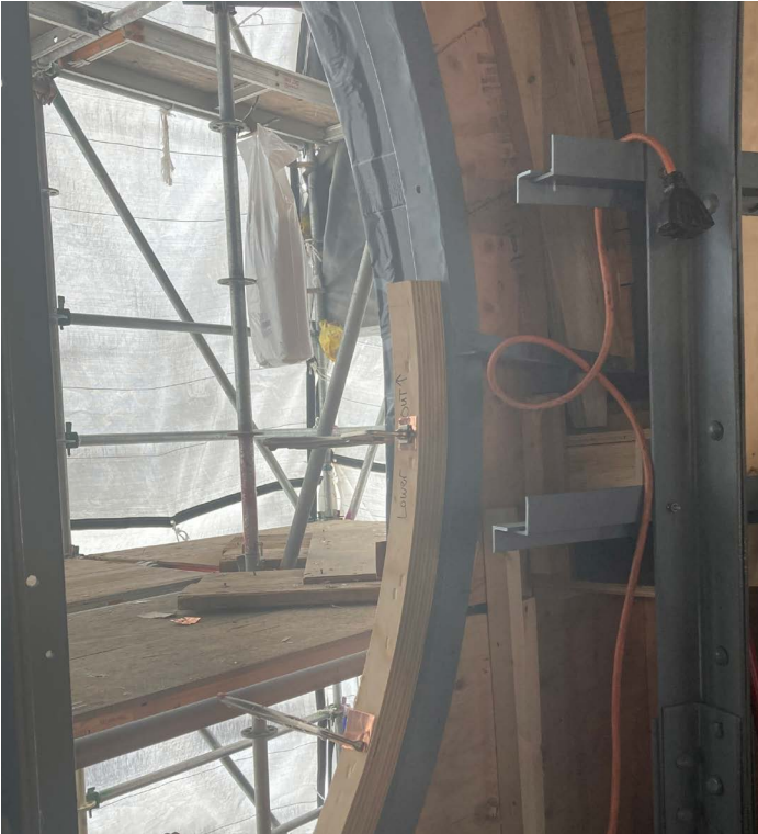
Fitting of the clock dials.