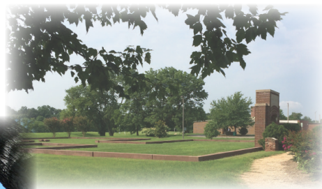
1 - Manassas Industrial School/ Jennie Dean Memorial 9601 Wellington Rd. Manassas, VA