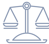
SERVE ON A JURY