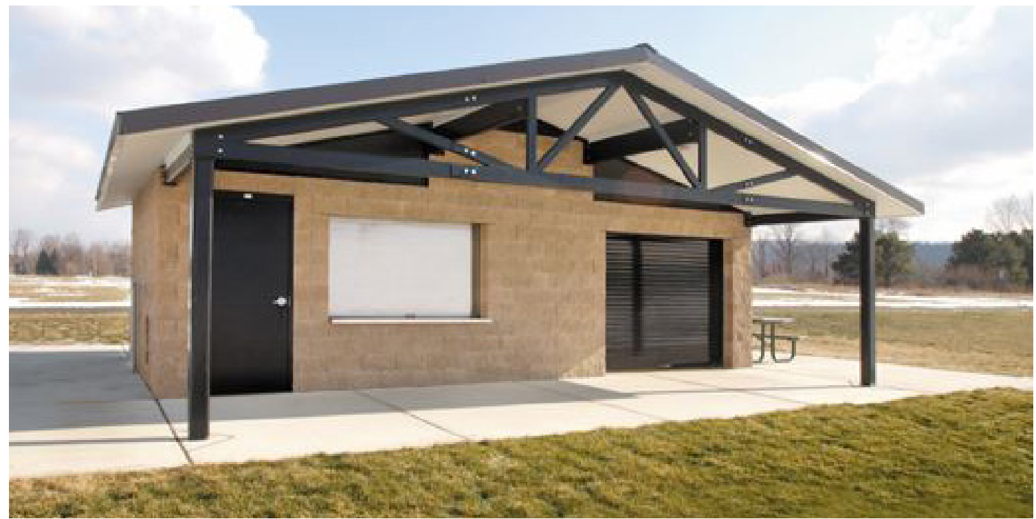
12 Support Building