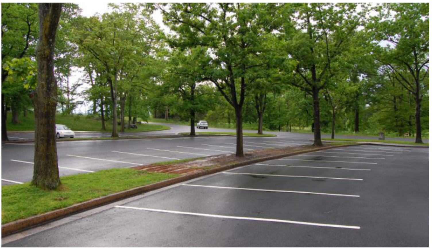
8 Extended Parking