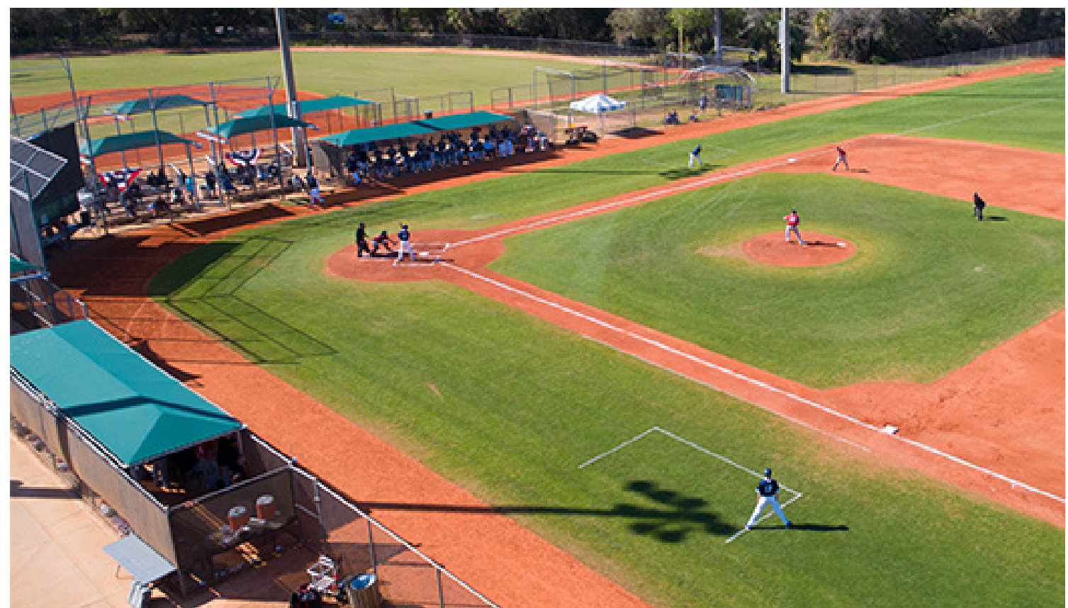
15 Renovation to Existing Diamond Fields