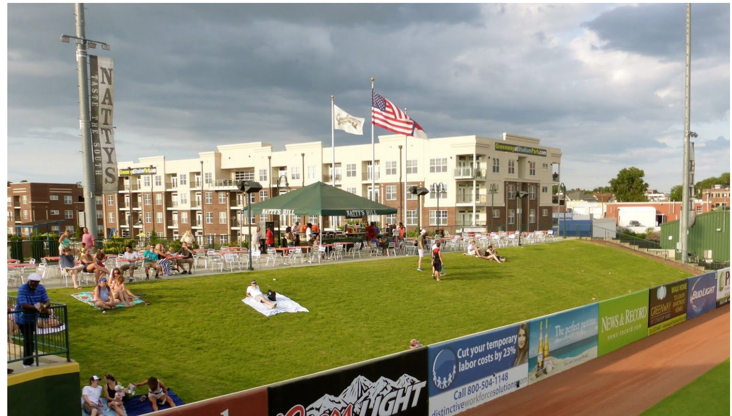
6 Spectator Berm