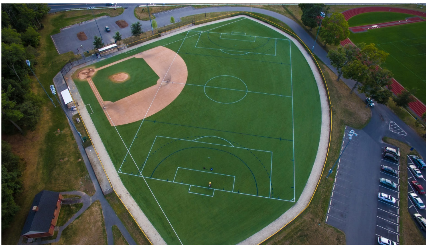
11 Synthetic Turf Diamond Field with Overlayed Rectangular Field