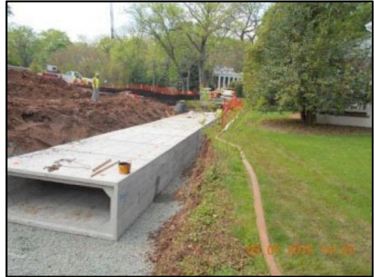
Upper Flat Branch Interceptor Project

Planning and construction continues to replace sections of gravity sewer main along the Upper Flat Branch Interceptor.