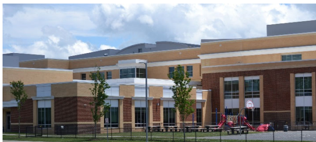
Baldwin Elementary & Intermediate School

Continued district wide technology improvements, school bus replacements, and school bus additions.