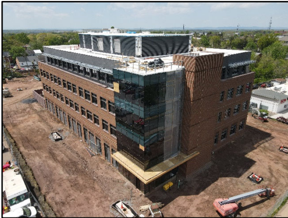
Public Safety Facility

Continued construction of the Public Safety Facility at 9608 Grant Avenue is underway. The facility will include Police Headquarters, consolidated public safety logistics, 911 Center, Emergency Operations Center, Fire & Rescue Administration, and the IT Department.