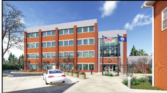
Marvin L. Gillum City Hall

Completed design and began renovations to City Hall (G-016).