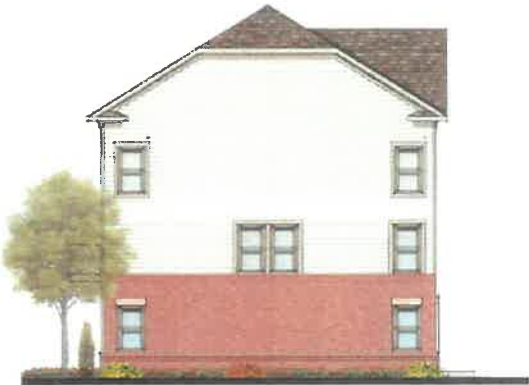
STANDARD SIDE ELEVATION