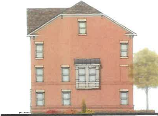
HIGH VISIBILITY SIDE ELEVATION

The end units that face Godwin Drive and Hastings Drive are the high-visibility sides.